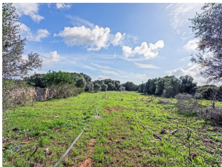
View of the plot