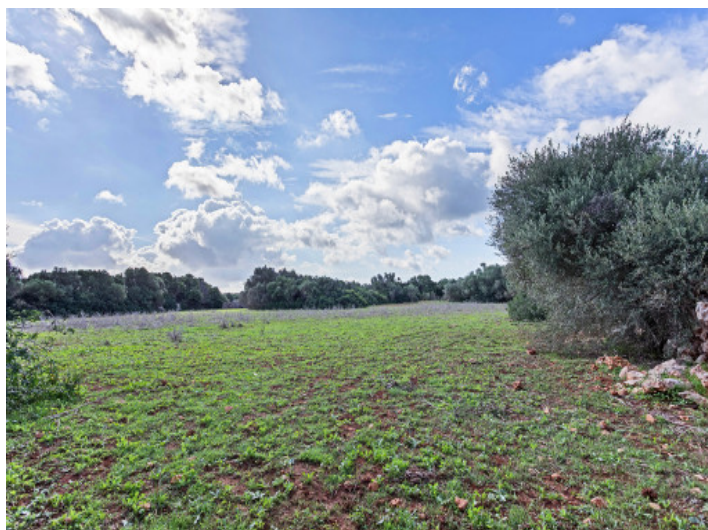
View of the plot