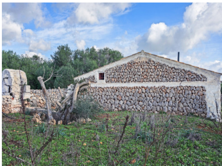
View of the stone facade