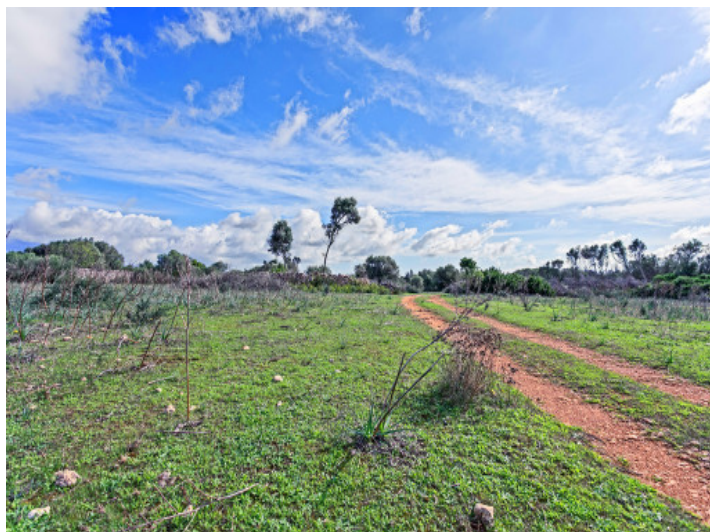
Large plot of 22 ha