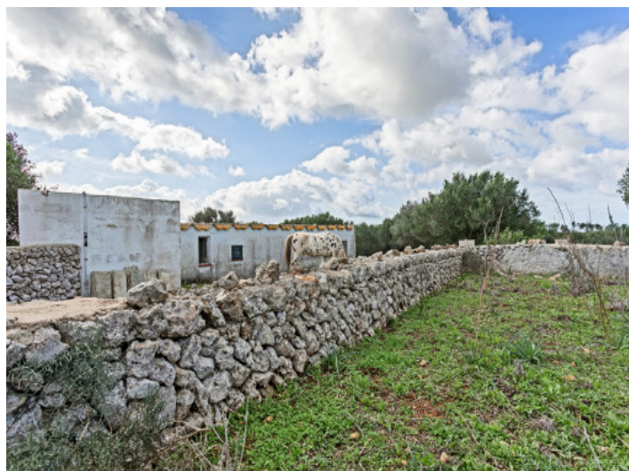
View of the plot

All information is correct to the best of our knowledge. Errors and prior sale excepted. This prospectus is purely for information purposes. Only the notarized deed of sale is legally binding.