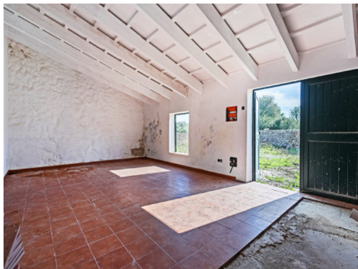
Entrance to the house