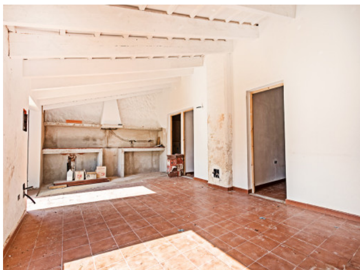
Large room with kitchen