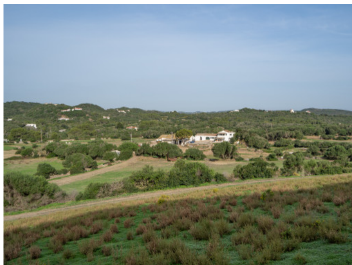
View of the finca

All information is correct to the best of our knowledge. Errors and prior sale excepted. This prospectus is purely for information purposes. Only the notarized deed of sale is legally binding.