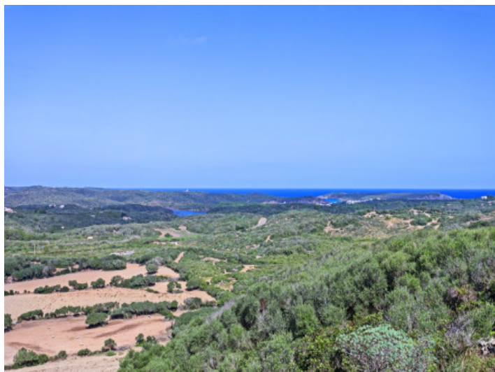
Panorama sea view