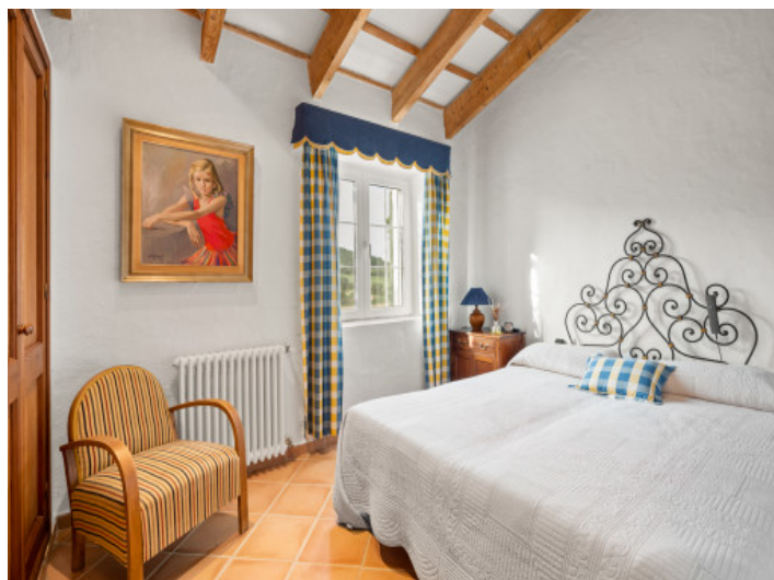
Lovely double bedroom

All information is correct to the best of our knowledge. Errors and prior sale excepted. This prospectus is purely for information purposes. Only the notarized deed of sale is legally binding.