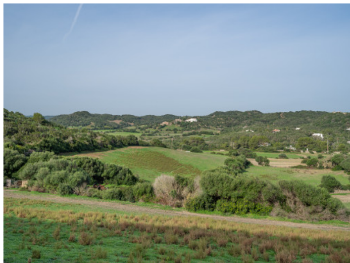
Large 44ha country estate