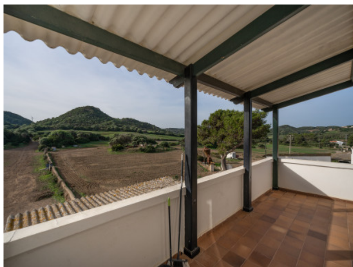
Upper terrace with views sweeping views