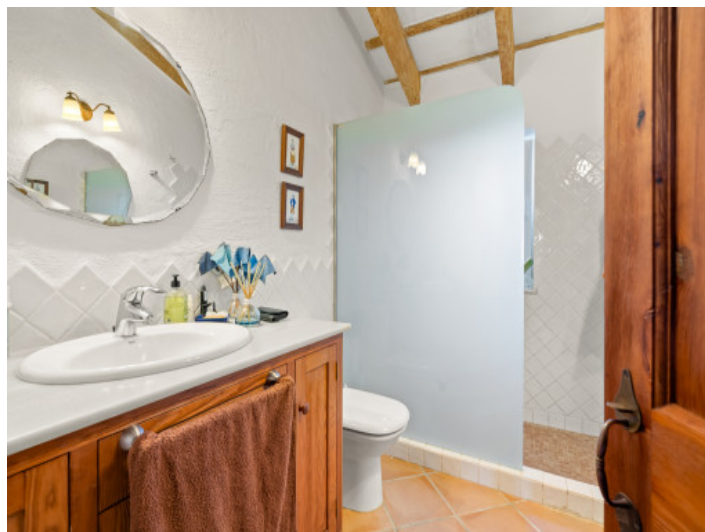
Beautiful shower bathroom