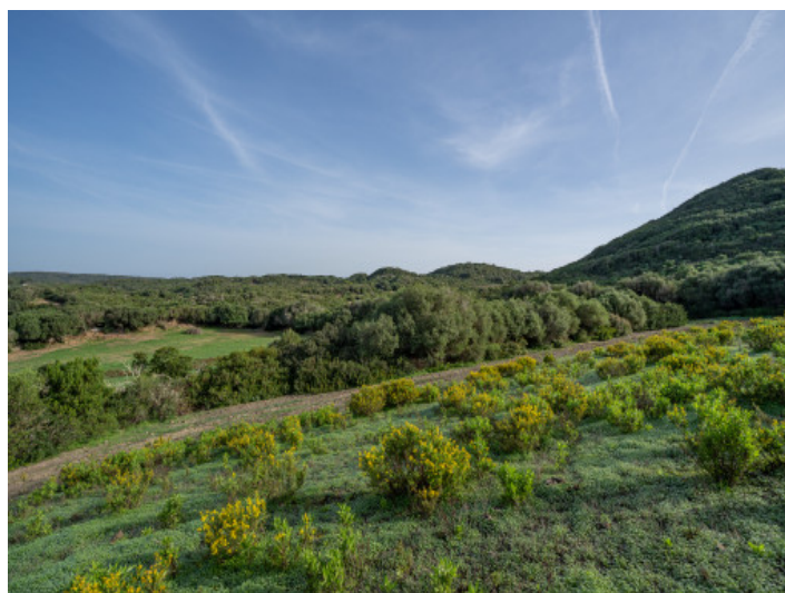
View over the plot and the countryside