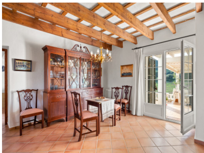
Access to the large, covered terrace