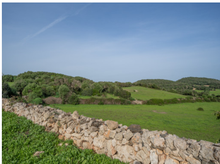
View over the plot and the countryside