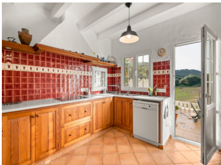
Beautifully country house kitchen with terrace access