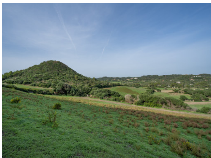
View over the plot and the countryside