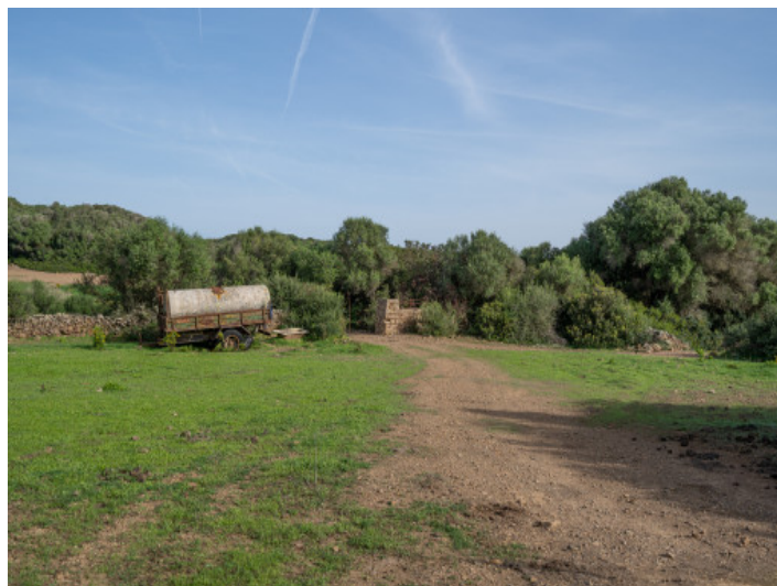
View over the plot