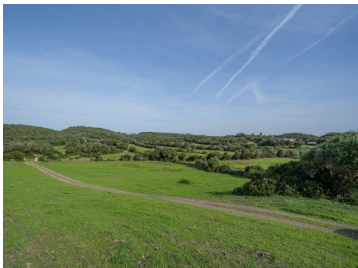
Driveway to the finca