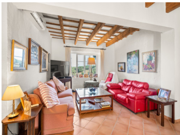
Cosy living room with wooden ceiling beams