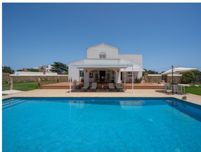
Large pool and terrace area