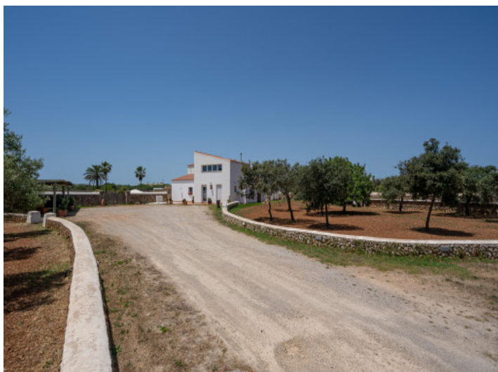
Driveway to the finca