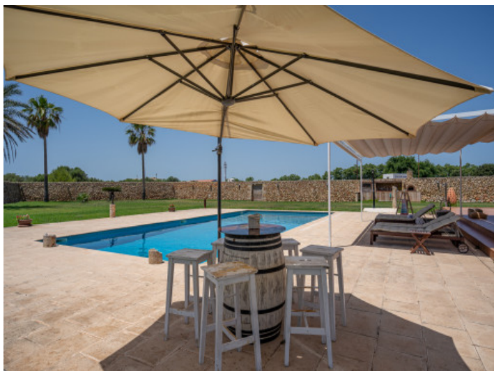
Beautifully laid-out pool area