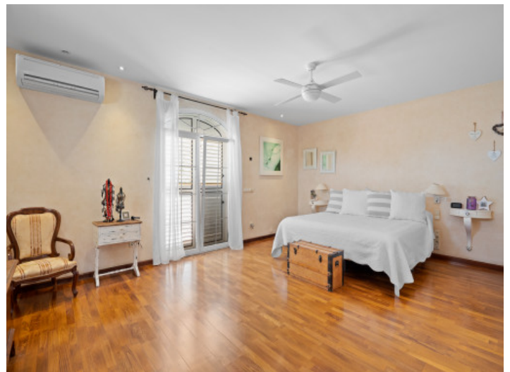
Bar Upper floor

All information is correct to the best of our knowledge. Errors and prior sale excepted. This prospectus is purely for information purposes. Only the notarized deed of sale is legally binding.