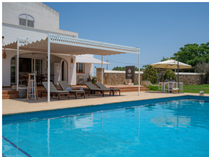
Large pool with sun terrace