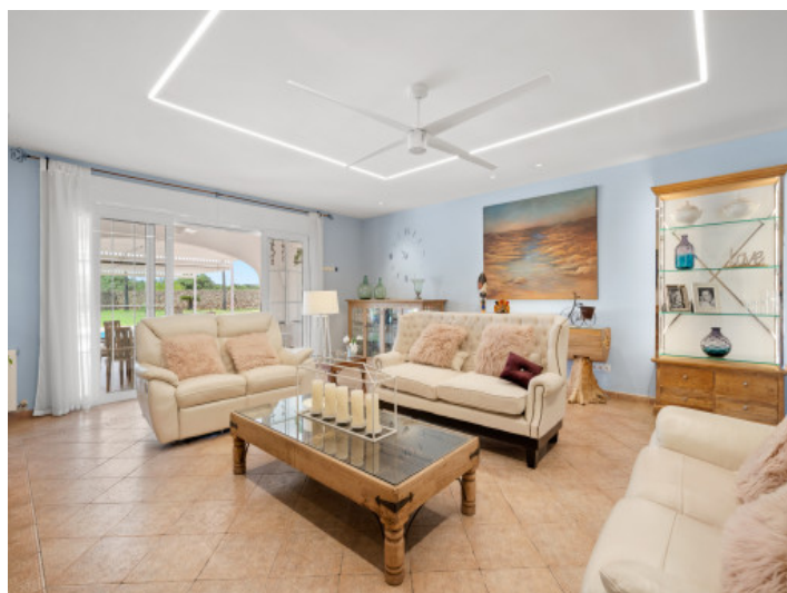
Lightflooded living area with terrace access