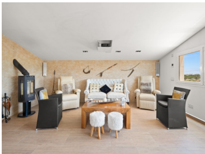
Beautiful seating area with fireplace