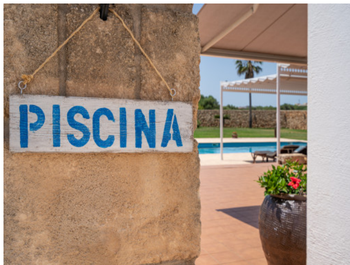
Access to the pool