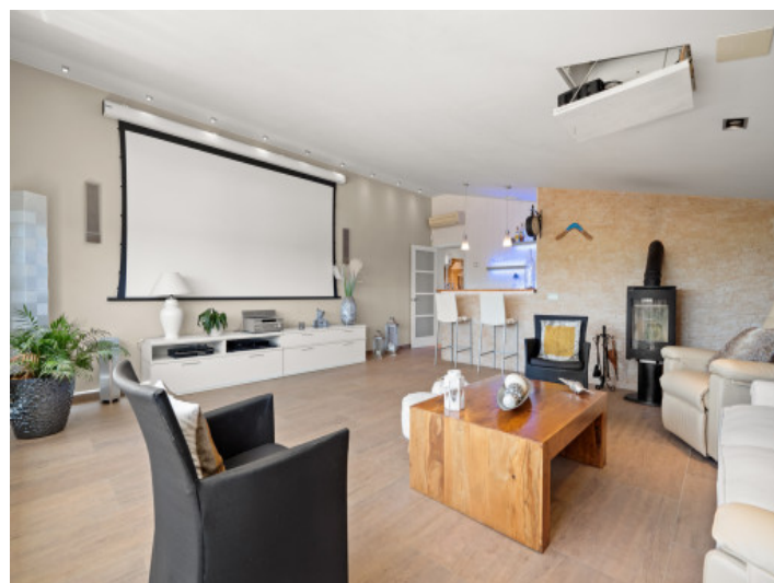
Home cinema with bar on the upper floor