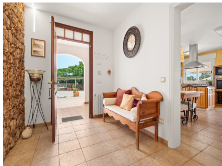
Inviting entrance to the finca

All information is correct to the best of our knowledge. Errors and prior sale excepted. This prospectus is purely for information purposes. Only the notarized deed of sale is legally binding.