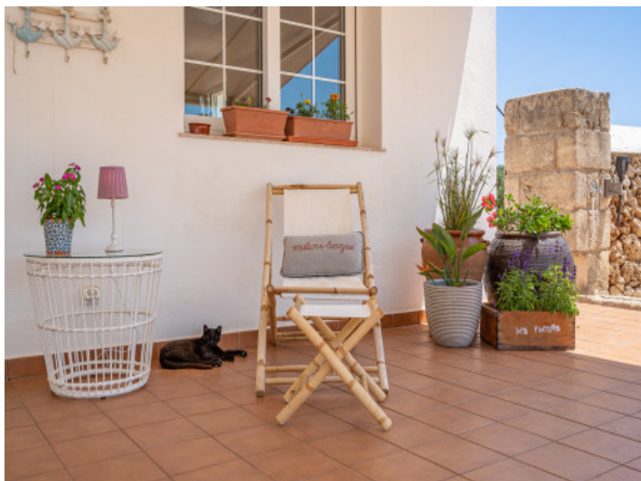
Idyllic terrace with shade