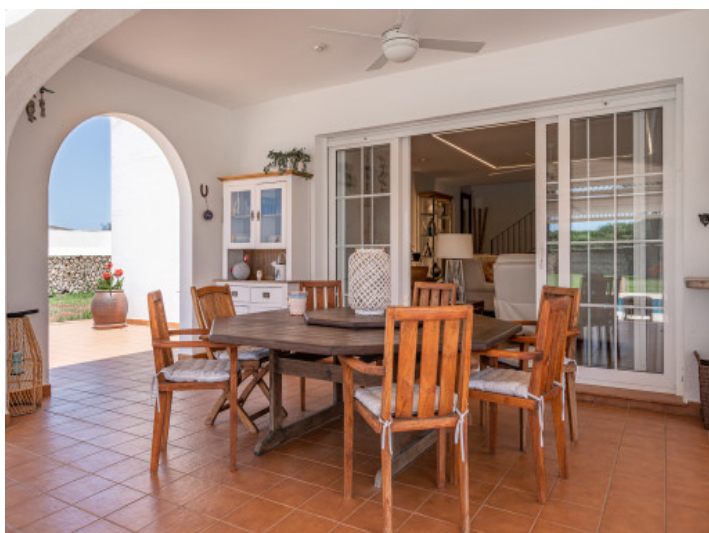
Covered terrace with dining area