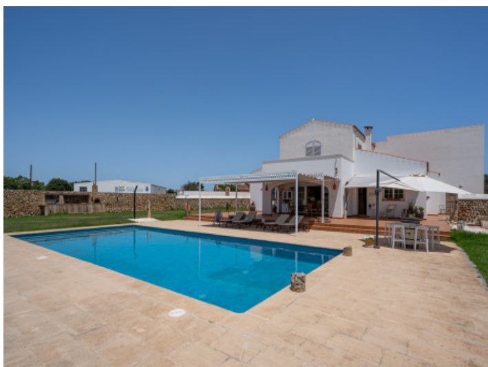
View of the finca with pool and terraces