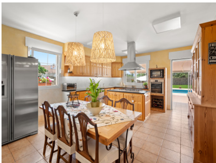
Beautiful, open dining area and kitchen