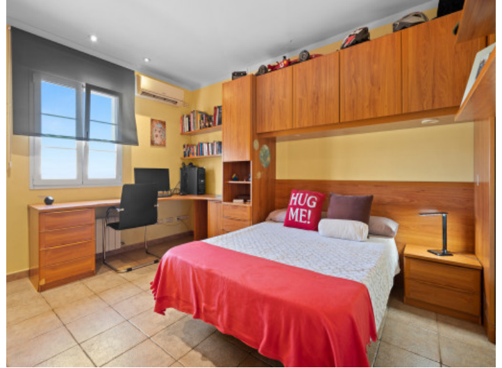
Bedroom and dressing room