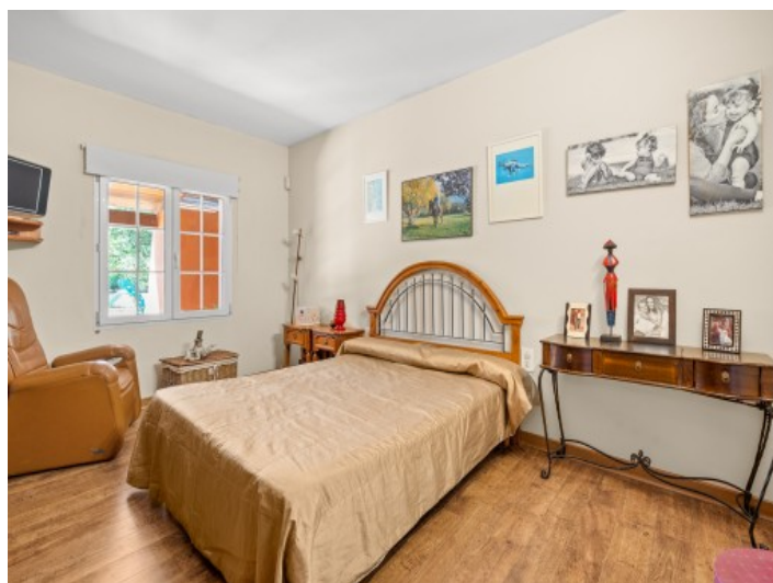
One of 5 bedrooms