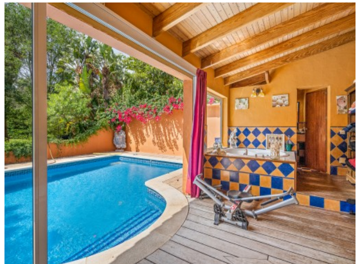
Covered pool terrace with jacuzzi