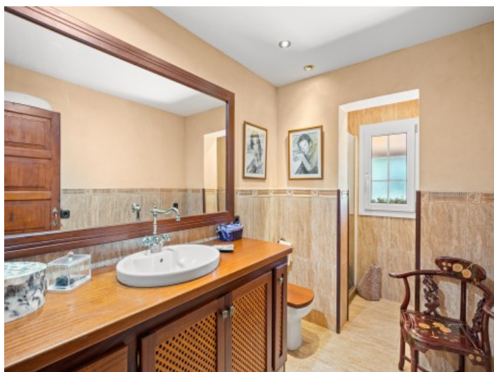
One of 4 bathrooms