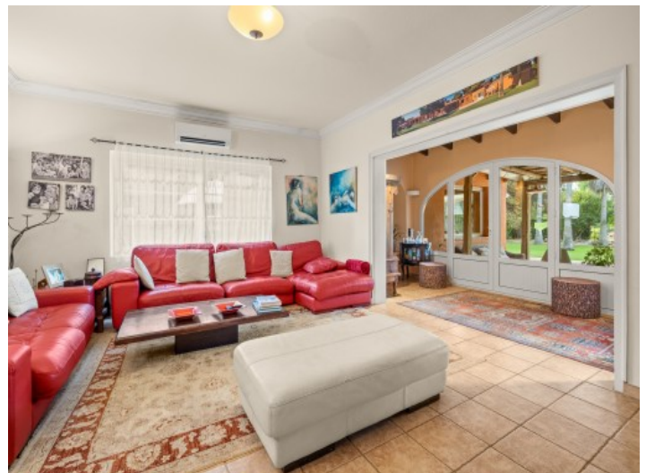
Generous living area

All information is correct to the best of our knowledge. Errors and prior sale excepted. This prospectus is purely for information purposes. Only the notarized deed of sale is legally binding.