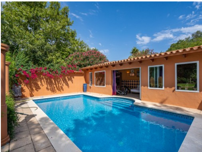
Pool with absolute privacy