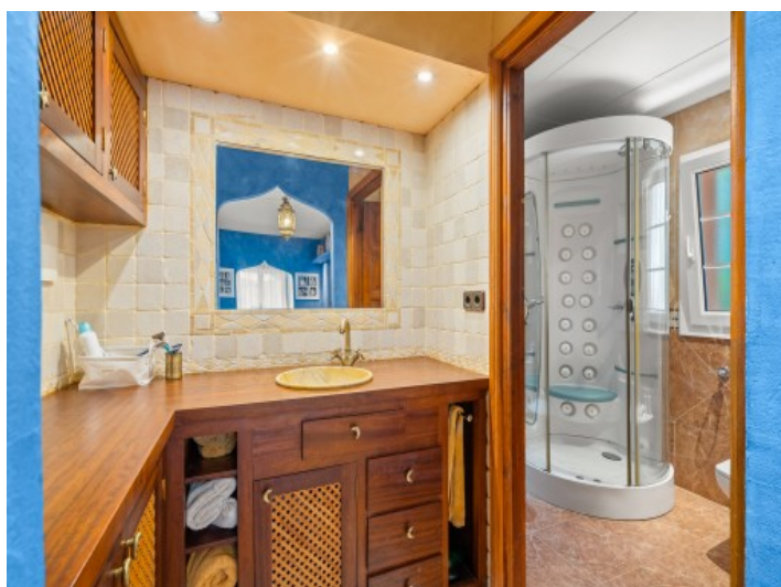
One of 4 bathrooms