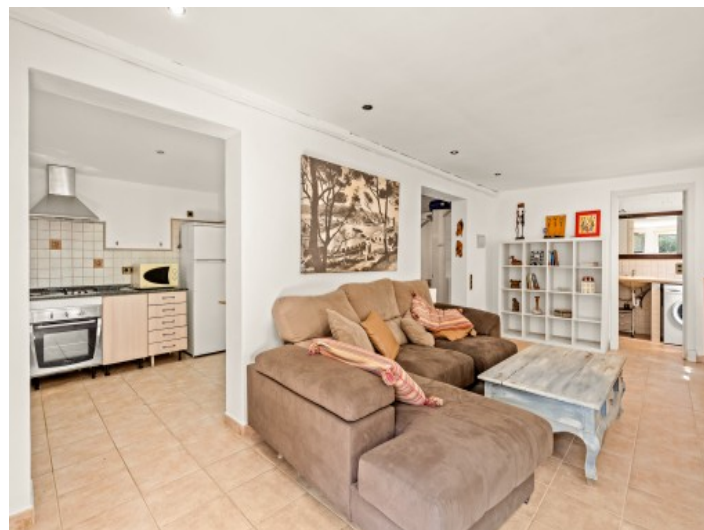
Separate guest apartment