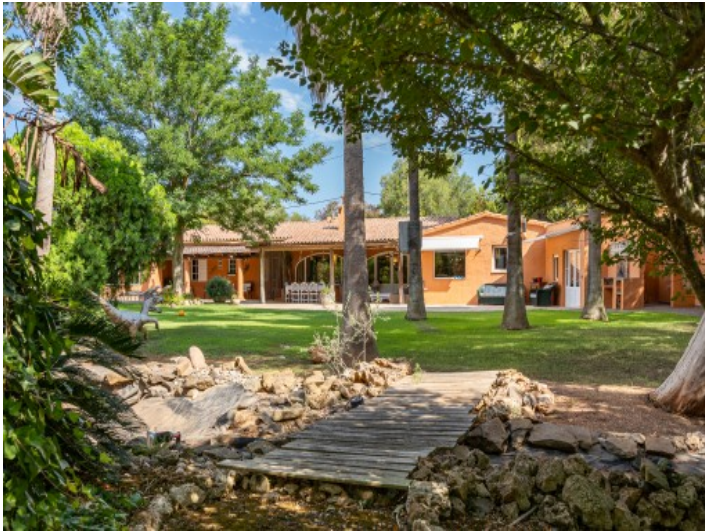
Finca with wonderful garden