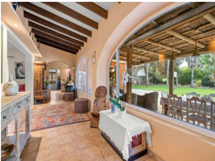
Large window front and terrace access