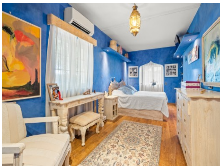
One of 5 bedrooms