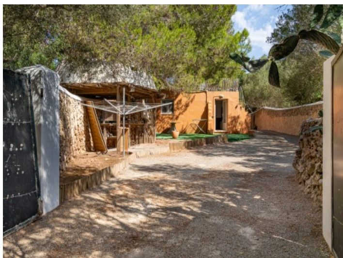
Access to the guest apartment