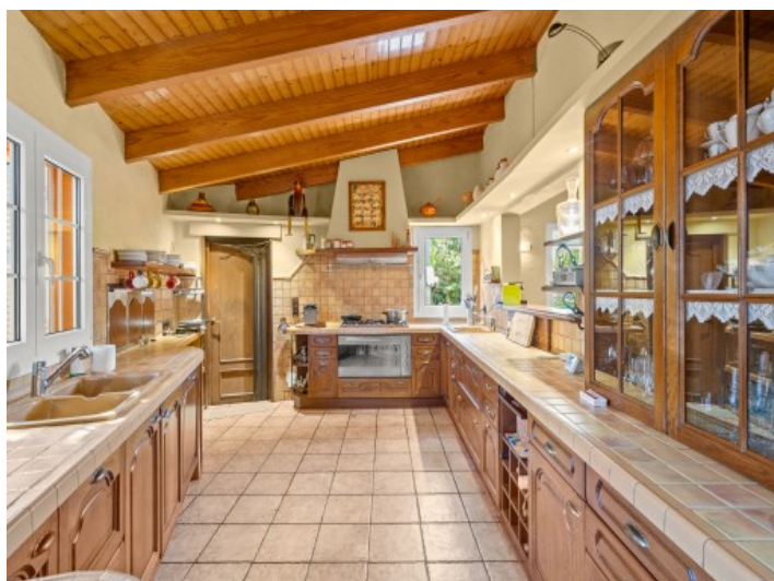
Large country house kitchen