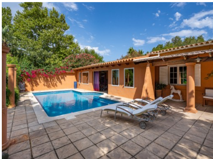
Lovely pool and terarce area