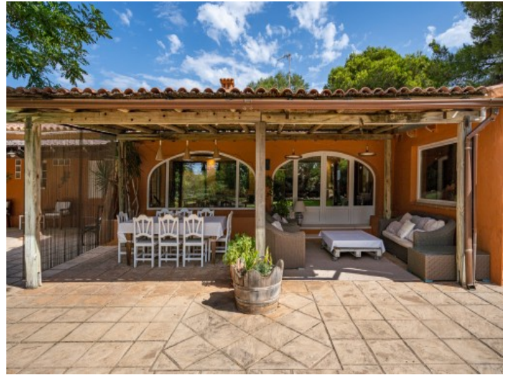
Large outdoor dining area