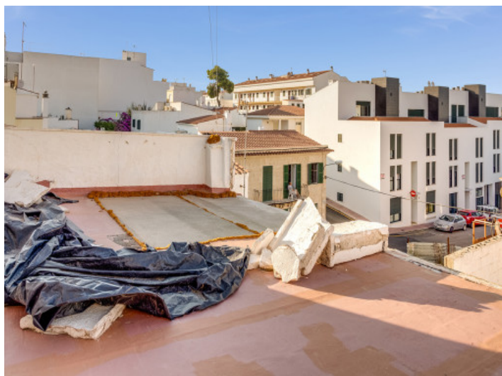
Sunny roof terrace

All information is correct to the best of our knowledge. Errors and prior sale excepted. This prospectus is purely for information purposes. Only the notarized deed of sale is legally binding.