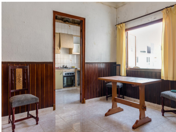
The town house needs a renovation