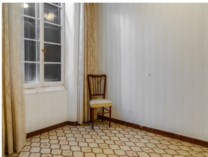
The house offers a lot of potencial