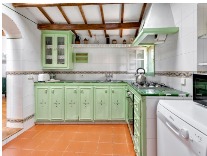
Fully equipped, rustic kitchen