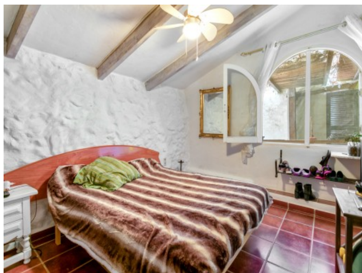
Bedroom of the guest house