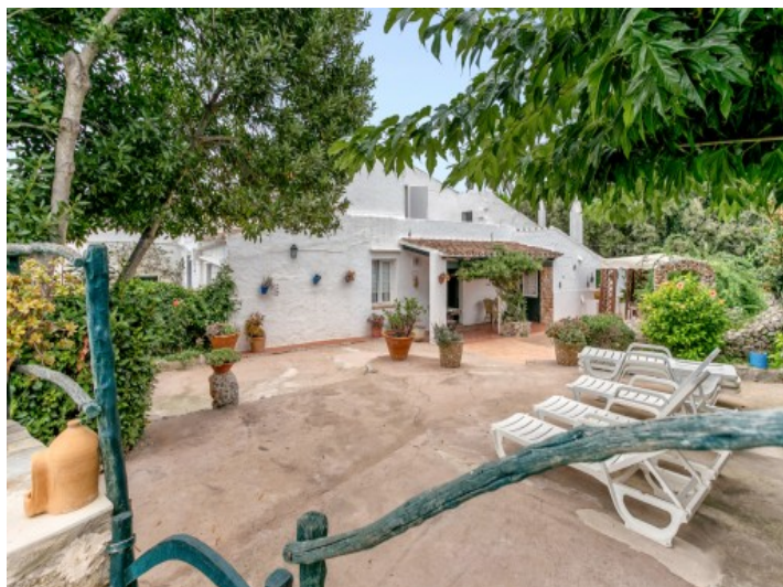
Exterior views of the finca