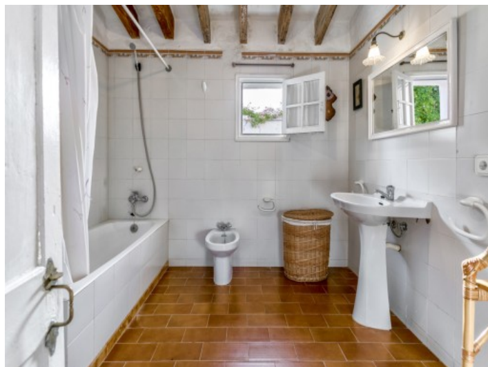
Bathroom with daylight