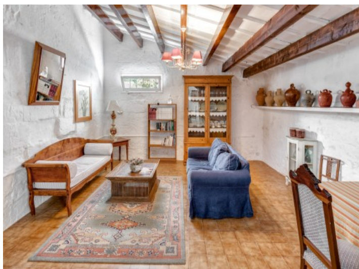
Alternative views of the living area