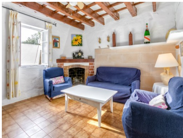
Cosy living area with fireplace