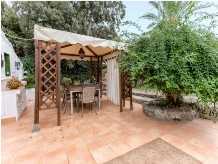
Exterior dining area