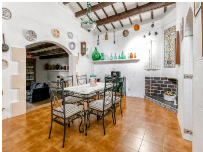
Dining area of the finca