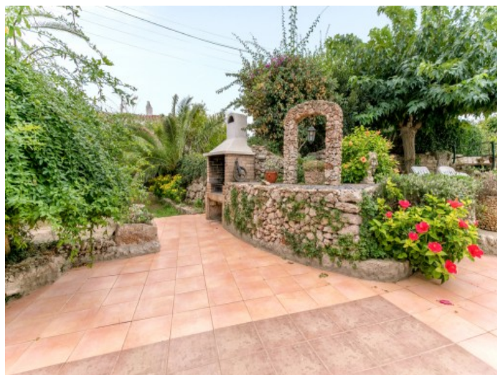
Well maintained garden

All information is correct to the best of our knowledge. Errors and prior sale excepted. This prospectus is purely for information purposes. Only the notarized deed of sale is legally binding.