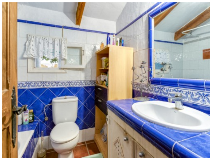
Bathroom of the guest house