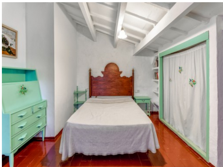
Second bedroom with built-in wardrobe