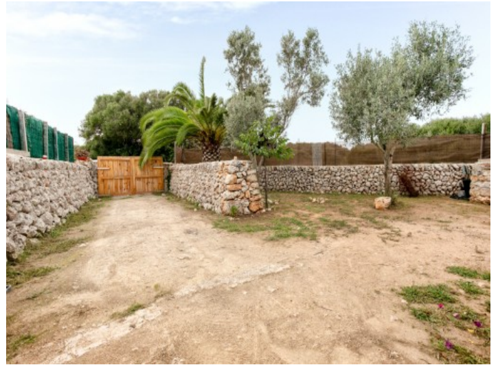
Large garden and entrance area

All information is correct to the best of our knowledge. Errors and prior sale excepted. This prospectus is purely for information purposes. Only the notarized deed of sale is legally binding.