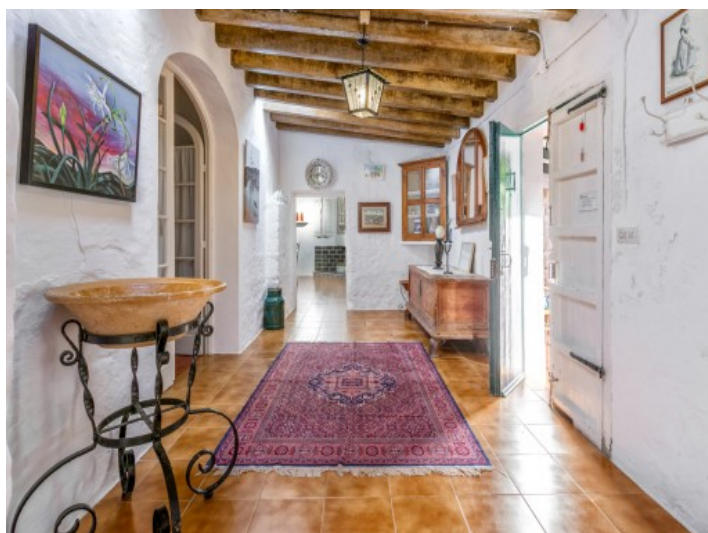
Bright entrance area of the finca