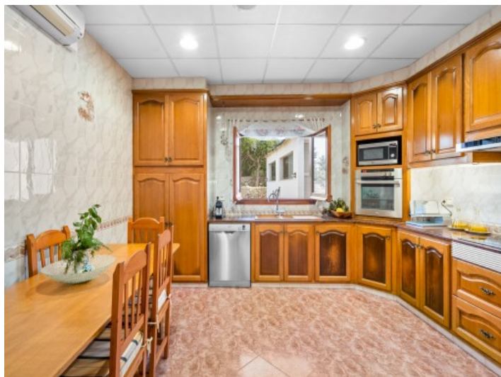
Rustic kitchen with ample space