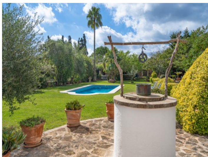
Own fountain in the garden

All information is correct to the best of our knowledge. Errors and prior sale excepted. This prospectus is purely for information purposes. Only the notarized deed of sale is legally binding.