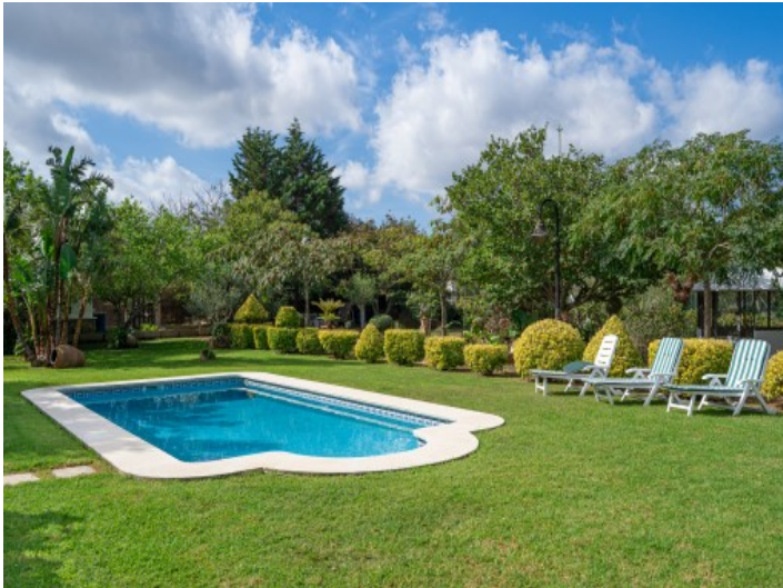
Tranquil pool and garden area