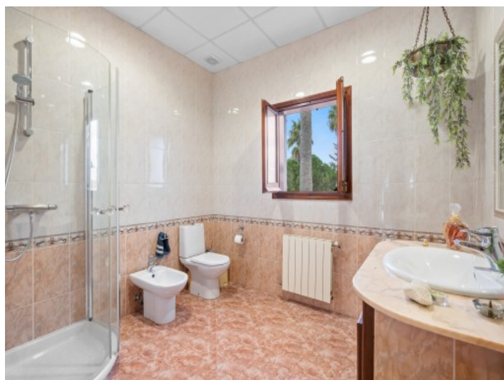
Bright shower bathroom