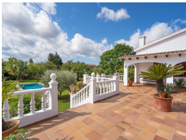
Large terrace with stairs to the garden