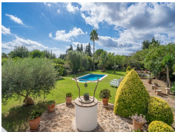
View over the wonderful plot