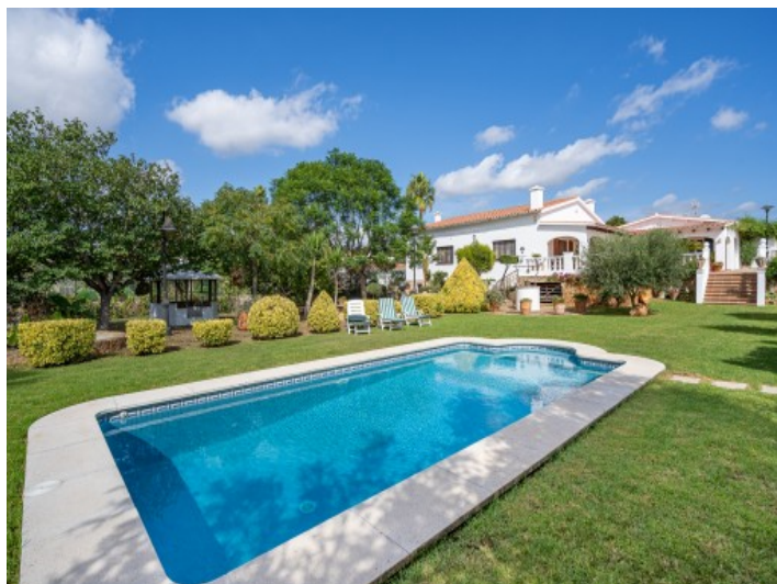
Beautifully laid-out pool area