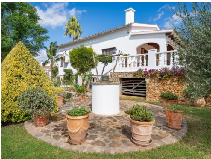
Charming typical menorcan property