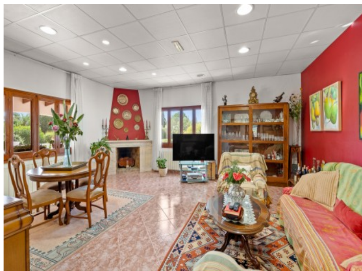
Living and dining area with fireplace

All information is correct to the best of our knowledge. Errors and prior sale excepted. This prospectus is purely for information purposes. Only the notarized deed of sale is legally binding.