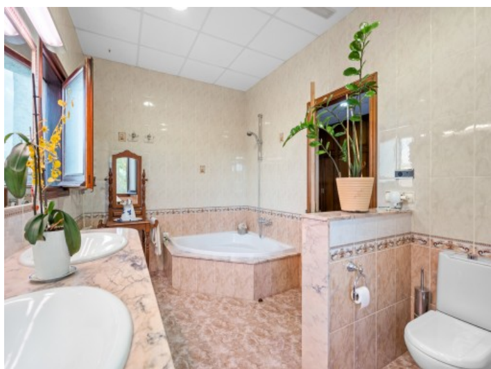
Second bathroom with bathtub