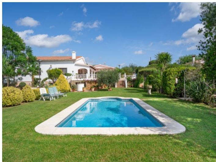
Very well-maintained garden