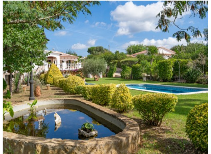
Lovely garden with pond and vegetation