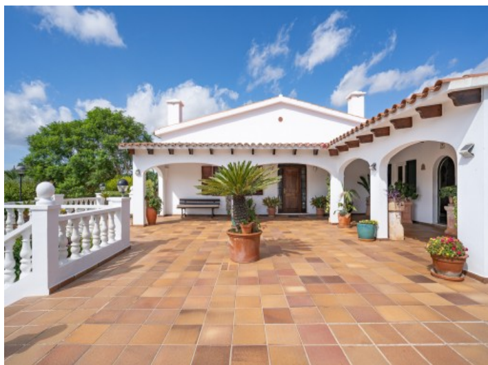
Terrace with partly covered areas