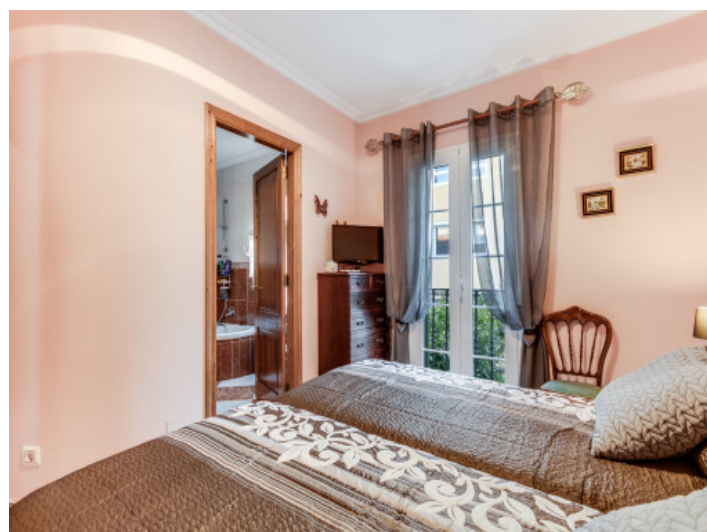
Bedroom with french balcony

All information is correct to the best of our knowledge. Errors and prior sale excepted. This prospectus is purely for information purposes. Only the notarized deed of sale is legally binding.