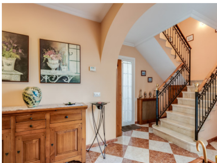
Inviting entrance area