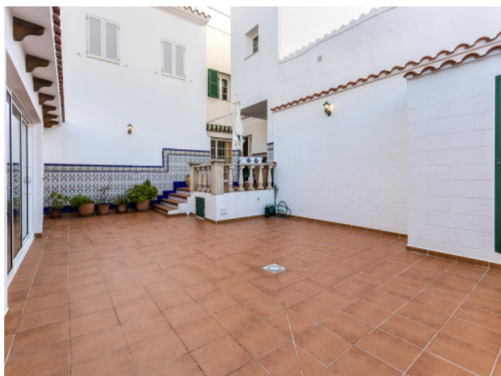
Large terrace on the ground floor