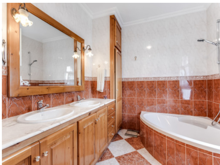
Bathroom en Suite with bathtub