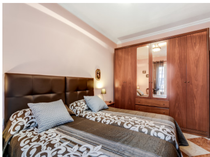
Master bedroom with built-in wardrobe