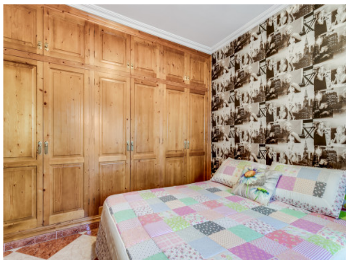
One of 5 bedroom