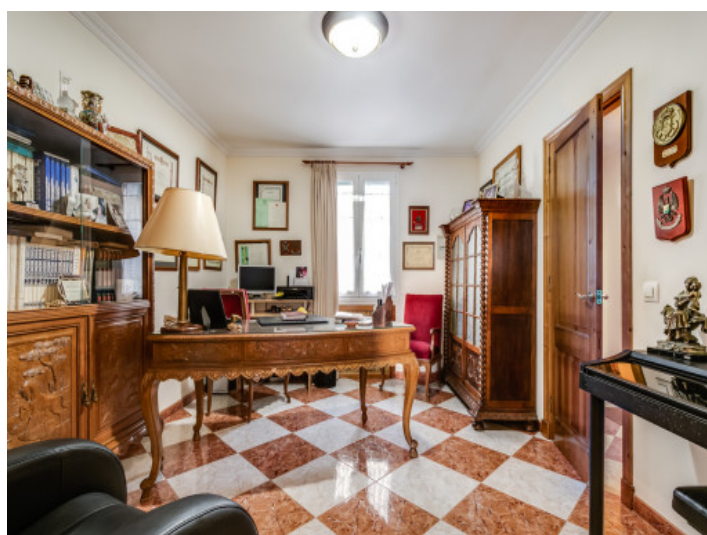
Capacious working room