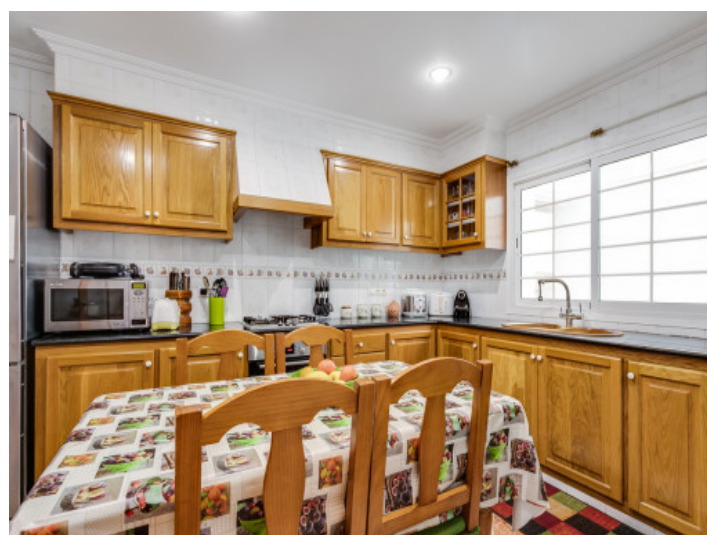
Kitchen with further dining area