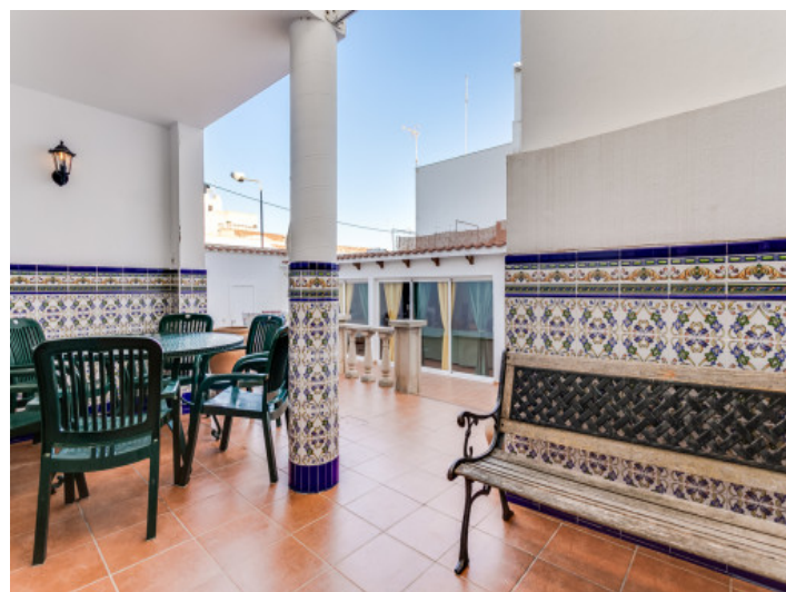
Terrace with beautifully tiled wall