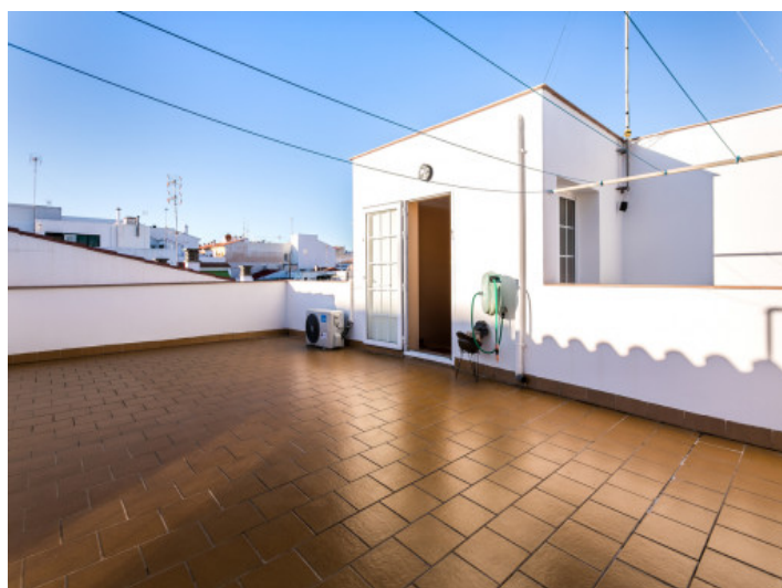
Private roof terrace

All information is correct to the best of our knowledge. Errors and prior sale excepted. This prospectus is purely for information purposes. Only the notarized deed of sale is legally binding.