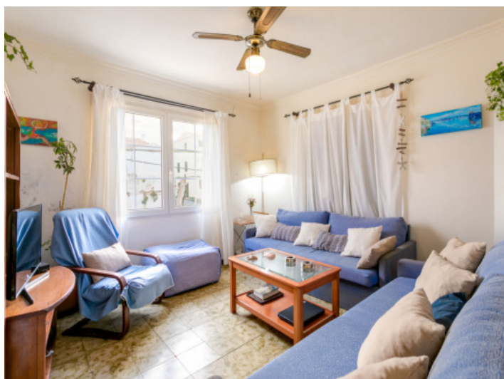
Friendly living area