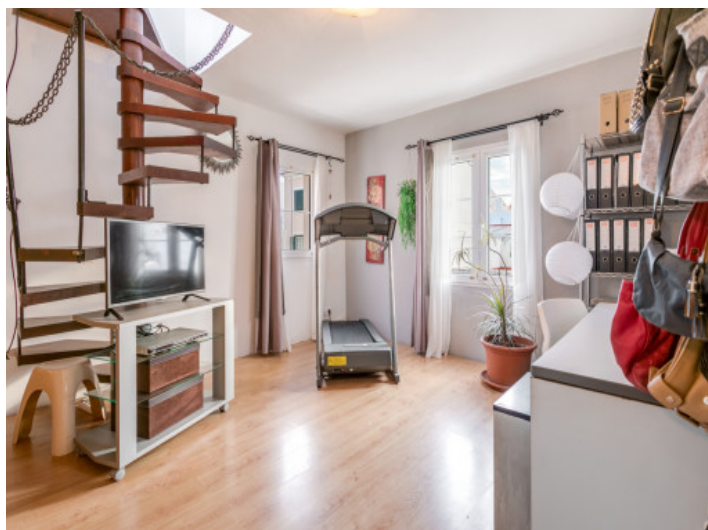
Bright suite on the second floor