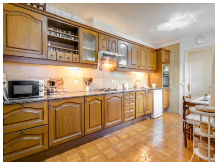
Dining area and fully equipped kitchen