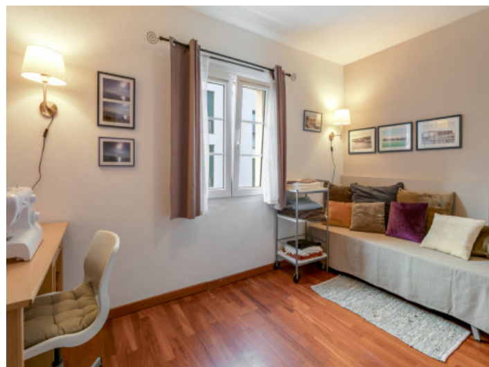
Quiet reading room

All information is correct to the best of our knowledge. Errors and prior sale excepted. This prospectus is purely for information purposes. Only the notarized deed of sale is legally binding.