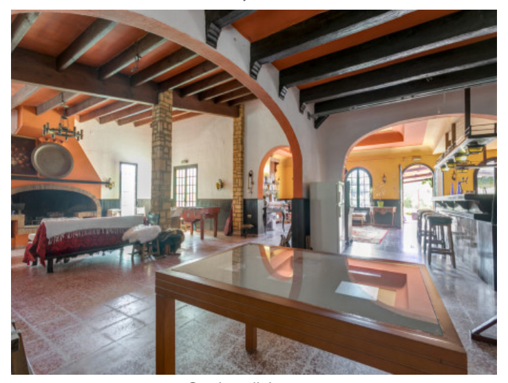
Spacious dining area