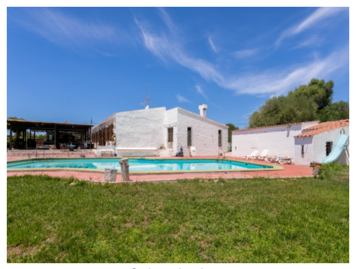
Garden and pool area