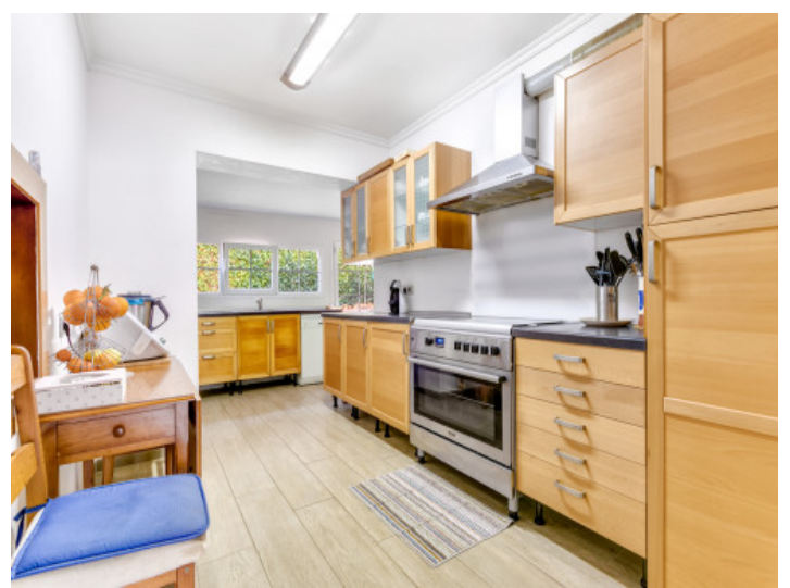
Spacious kitchen with garden views