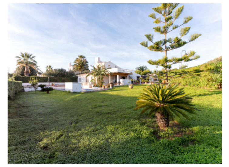
Wonderful, green garden