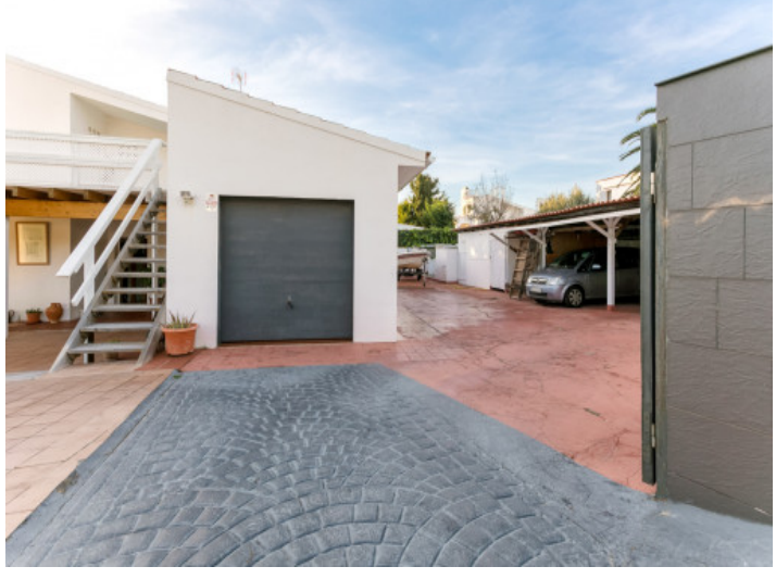
Backyard with ample space for cars

All information is correct to the best of our knowledge. Errors and prior sale excepted. This prospectus is purely for information purposes. Only the notarized deed of sale is legally binding.