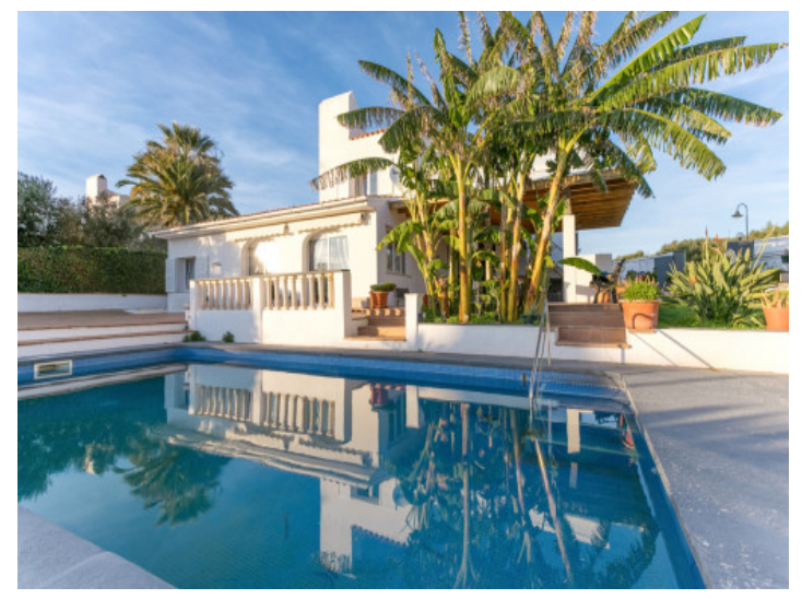
Large pool area with banana plant