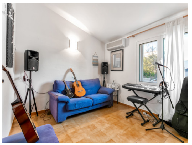
Further bedroom or leisure room