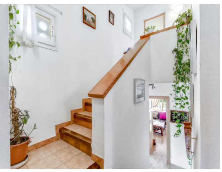
Staircase to the upper floor

All information is correct to the best of our knowledge. Errors and prior sale excepted. This prospectus is purely for information purposes. Only the notarized deed of sale is legally binding.