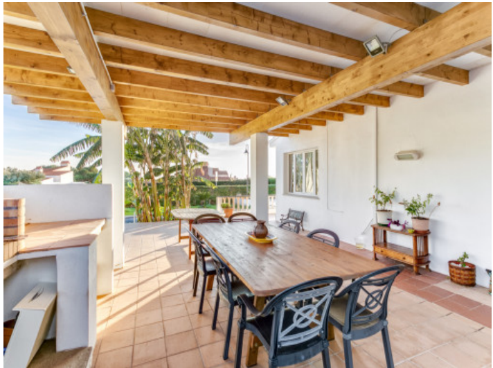
Covered terrace with large dining area