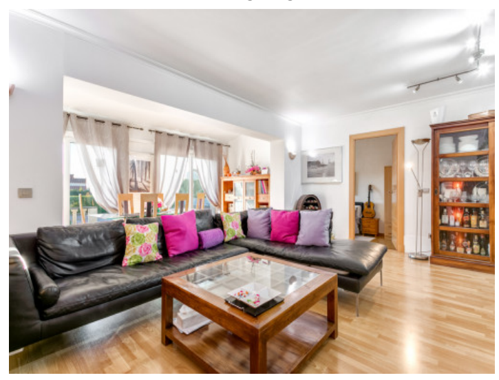
Light-flooded living area