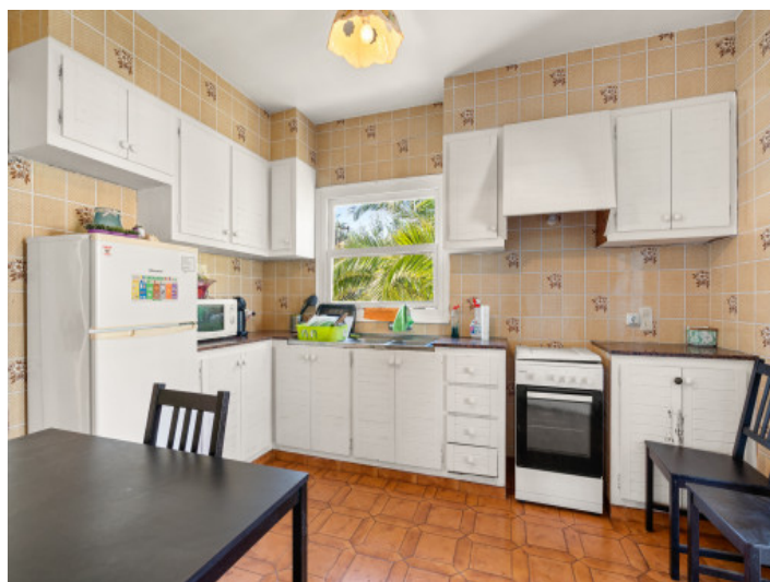
Bright kitchen with dining area