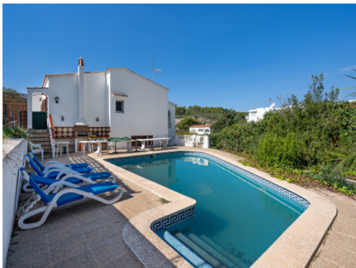
Pool area with many possibilities