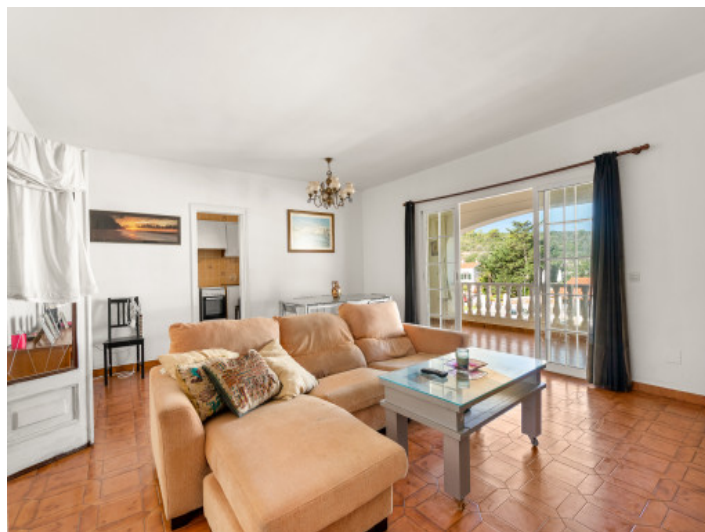
Lightflooded living and dining area