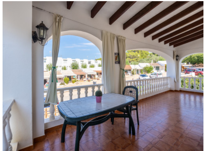
Large, covered terrace