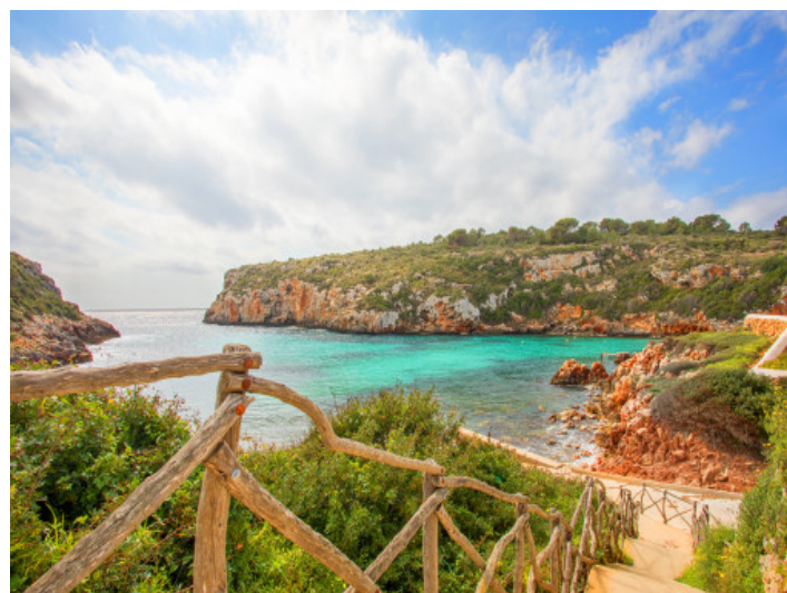
Access to the beach