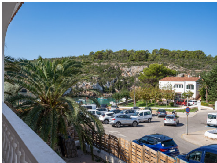
View to the sea from the terrace