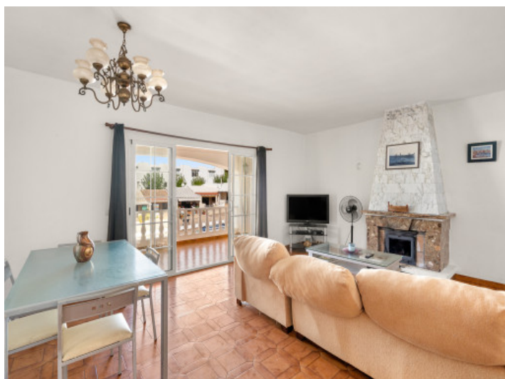
Direct terrace access