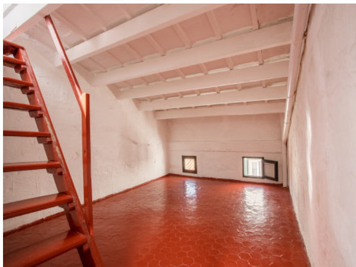
One of 6 rooms