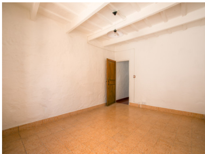
One of 6 rooms

All information is correct to the best of our knowledge. Errors and prior sale excepted. This prospectus is purely for information purposes. Only the notarized deed of sale is legally binding.