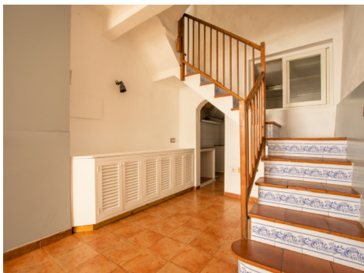
Open entrance area