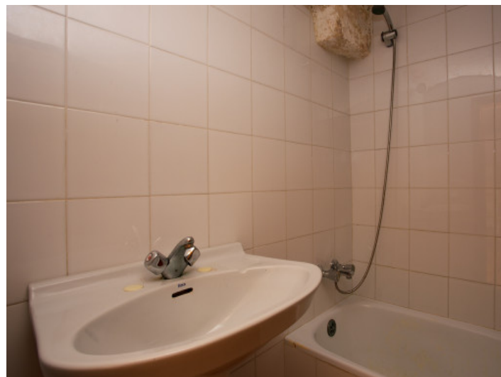
Bathroom with bath tub