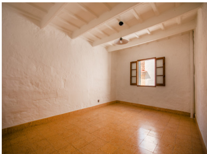
One of 6 rooms