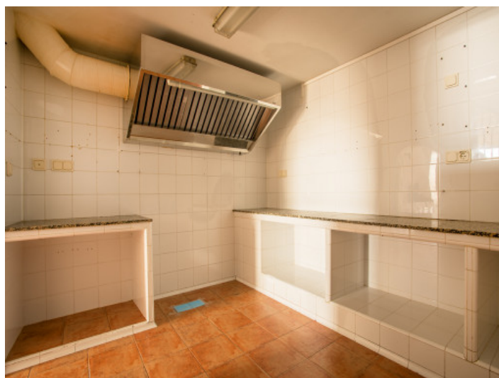
Rustic kitchen area