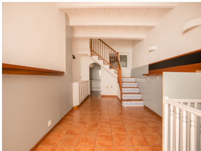
Open entrance area