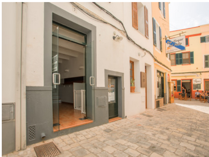
Exterior view of the house