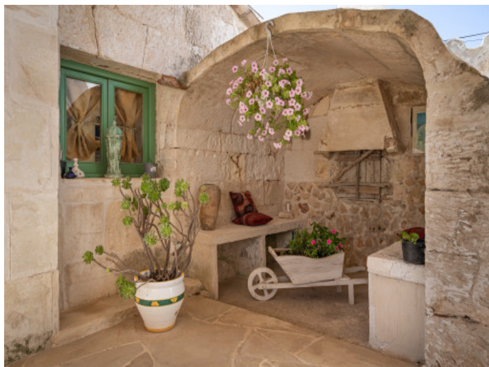
Beautiful wood-burning stove