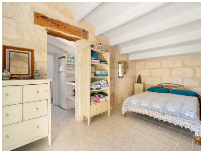
Double bedroom with sandstone walls

All information is correct to the best of our knowledge. Errors and prior sale excepted. This prospectus is purely for information purposes. Only the notarized deed of sale is legally binding.