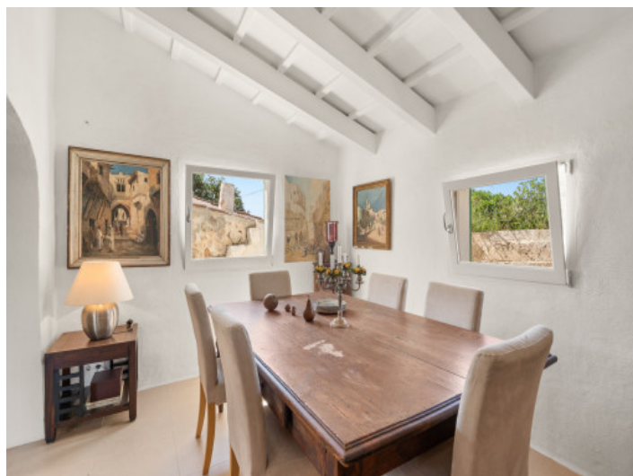
Bright and beautiful dining area

All information is correct to the best of our knowledge. Errors and prior sale excepted. This prospectus is purely for information purposes. Only the notarized deed of sale is legally binding.