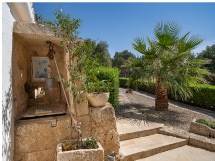
Original fountain next to the terrace