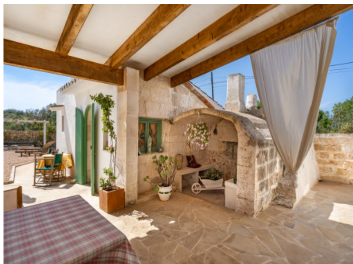
Guest house with lovely terrace

All information is correct to the best of our knowledge. Errors and prior sale excepted. This prospectus is purely for information purposes. Only the notarized deed of sale is legally binding.