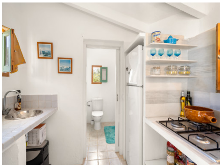
Small kitchen area and bathroom