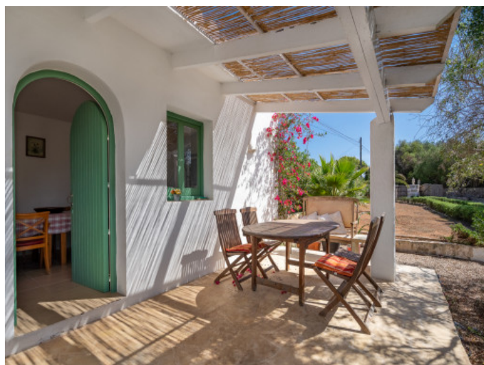
Further building with living and bedroom