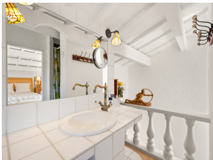
Lovely bathroom on the upper floor