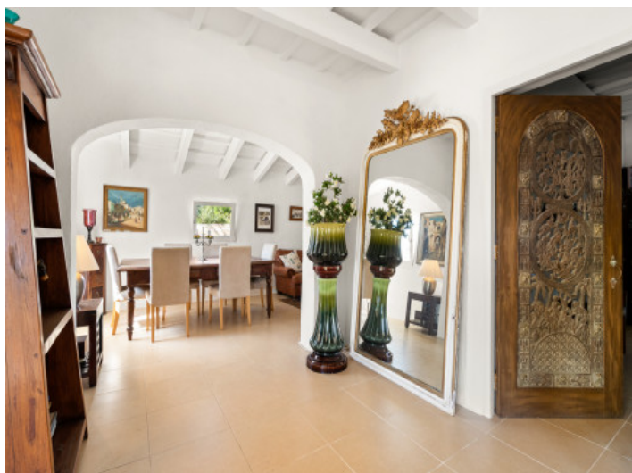
Tastefully and typically menorcan style