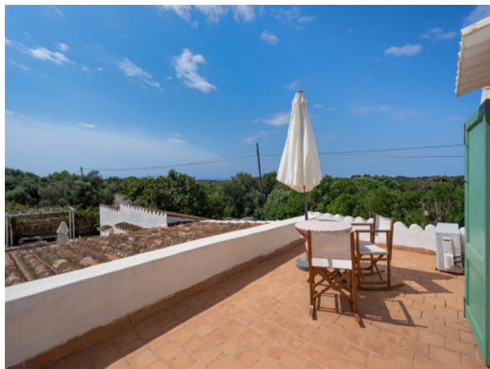
Roof terrace with sweeping views