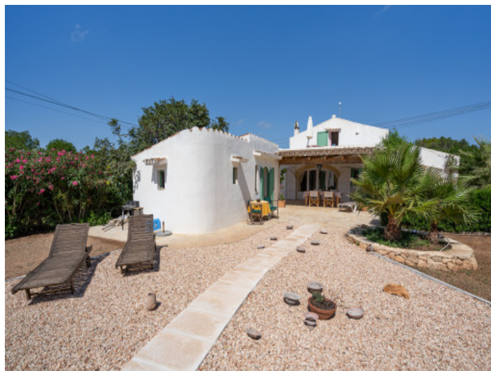
Exterior view and terraces