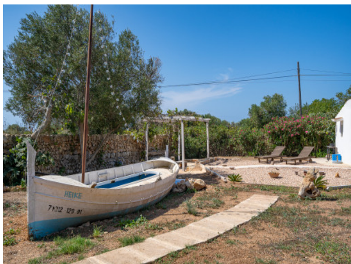
Large outdoor and garden area