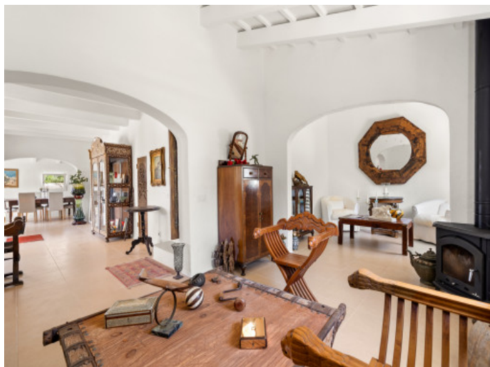
Spacious, open living area