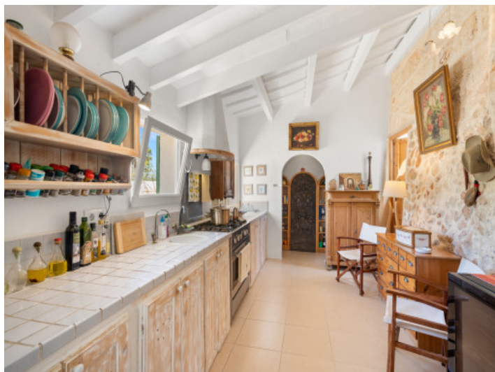
Kitchen with traditional charme