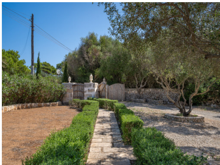
Access to the property

All information is correct to the best of our knowledge. Errors and prior sale excepted. This prospectus is purely for information purposes. Only the notarized deed of sale is legally binding.