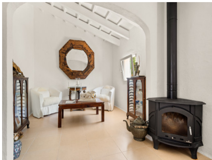
Cosy fireplace area