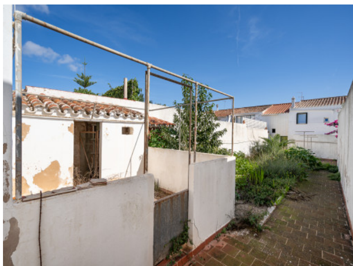
Terrace and garden