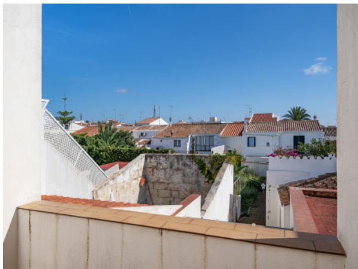
Menorquin house with garden for reformation in Sant Lluís