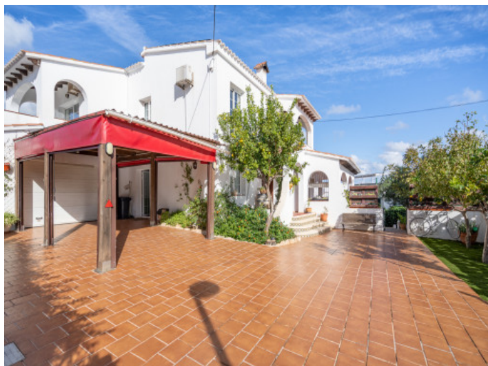
Large front terrace with double garage