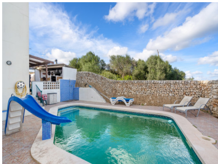
Pool with outdoor shower