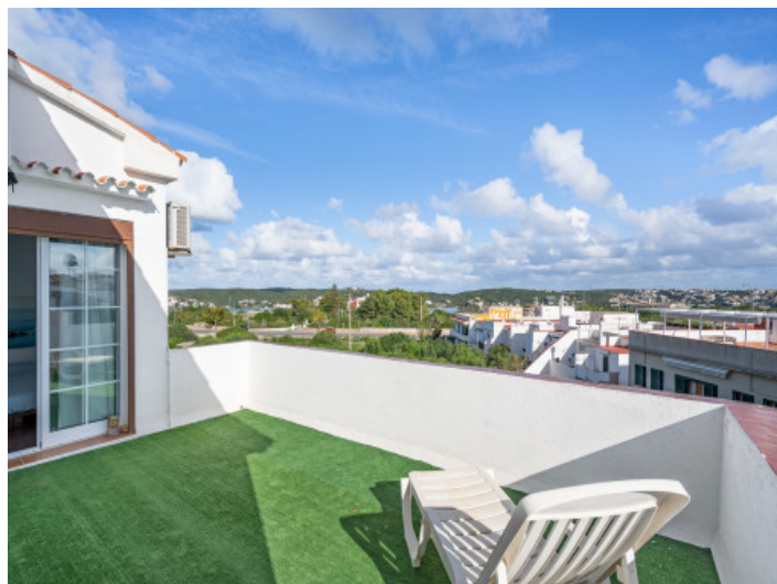
Large upper terrace with a view