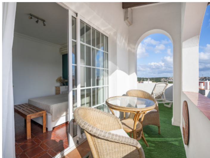
Terrace with seating area