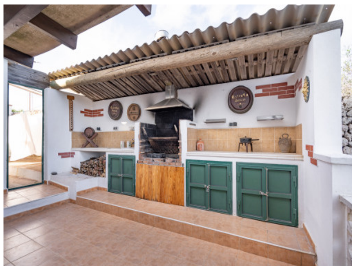
Fantastic bbq area