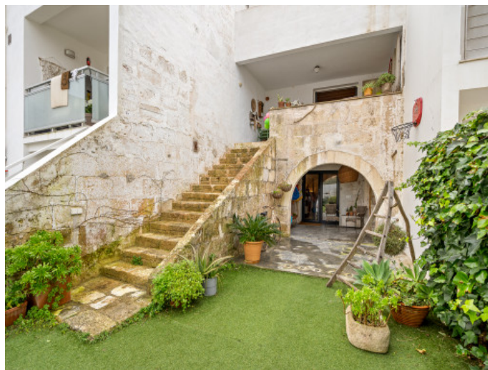
Enchanting garden with access to the souterrain