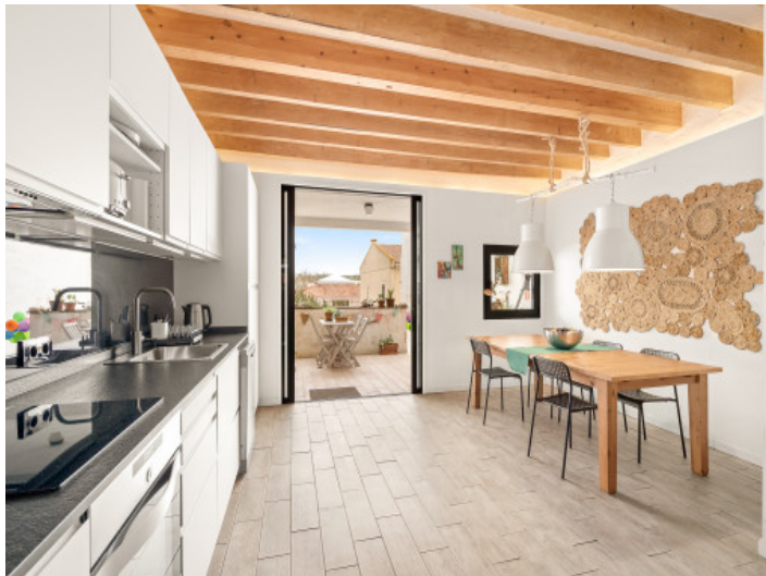
Wonderful kitchen with terrace