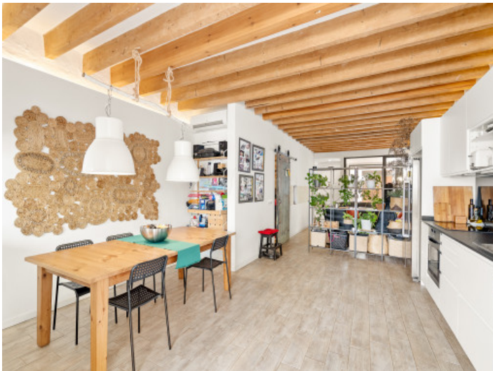
Adjoining, open dining area