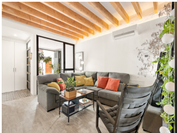
Inviting living and entrance area