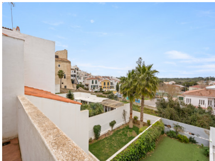
View from the upper terrace

All information is correct to the best of our knowledge. Errors and prior sale excepted. This prospectus is purely for information purposes. Only the notarized deed of sale is legally binding.