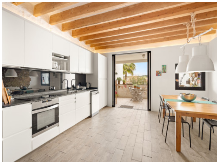
Fantastic and tastefully renovated village house with terrace and garden in