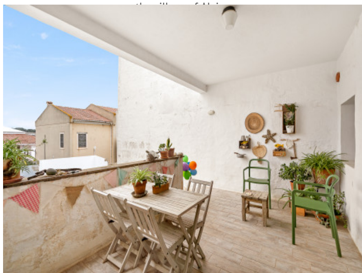
Outdoor dining area and access to the garden