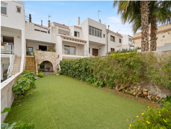
Townhouse with spacious patio / garden