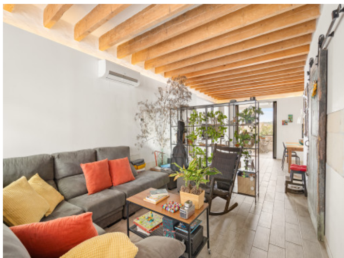
Beautiful living area with wooden ceiling beams