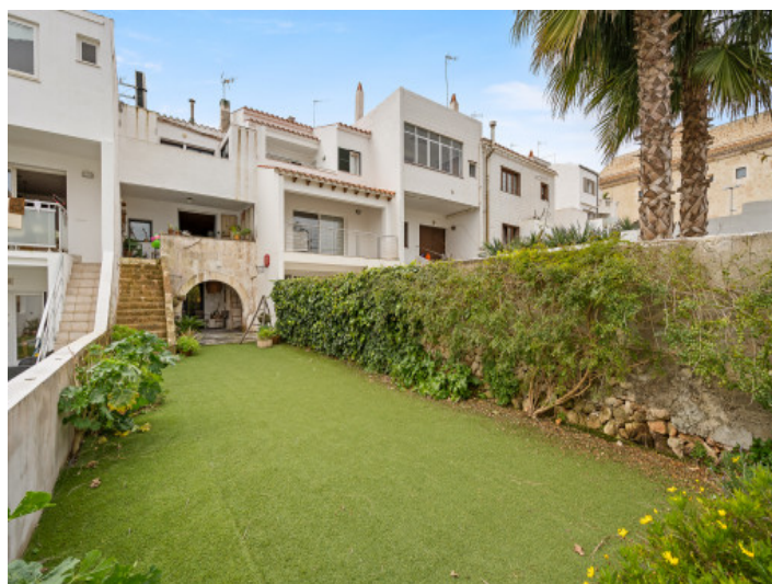
Townhouse with spacious patio / garden