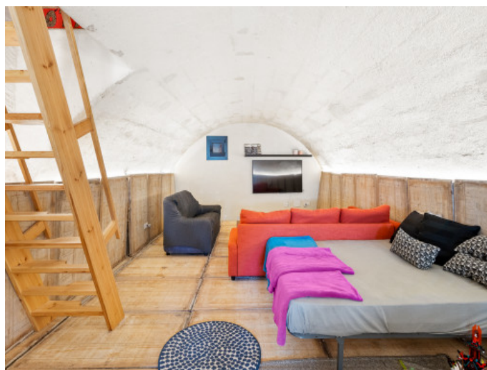
Separate living/ sleeping area in the souterrain