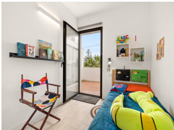
Kids room with further terrace