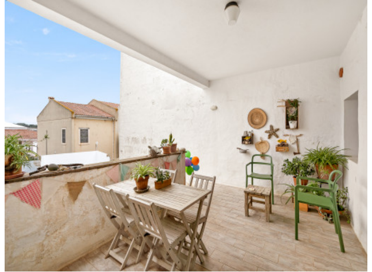
Outdoor dining area and access to the garden