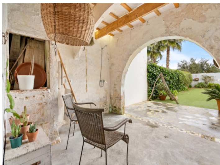
Rustic covered terrace in the garden