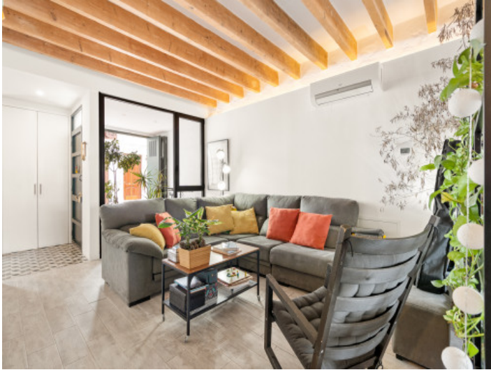
Inviting living and entrance area