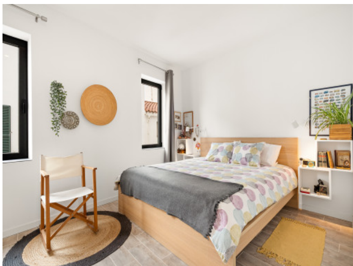
Beautiful double bedroom on the upper floor