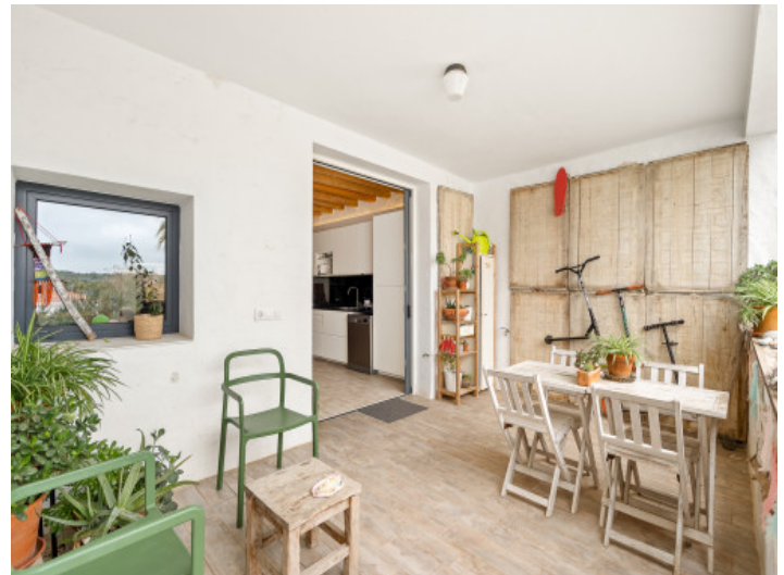
Fantastic covered kitchen terrace