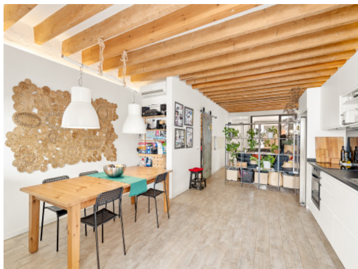
Adjoining, open dining area

All information is correct to the best of our knowledge. Errors and prior sale excepted. This prospectus is purely for information purposes. Only the notarized deed of sale is legally binding.