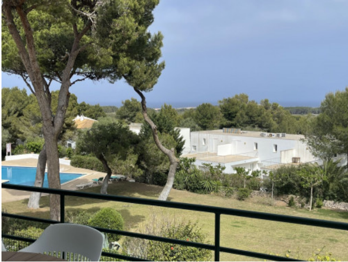
Sea view apartment