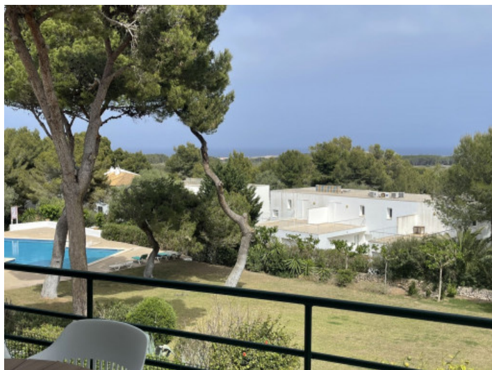
Sea view apartment