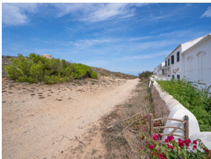
Rear view of the house