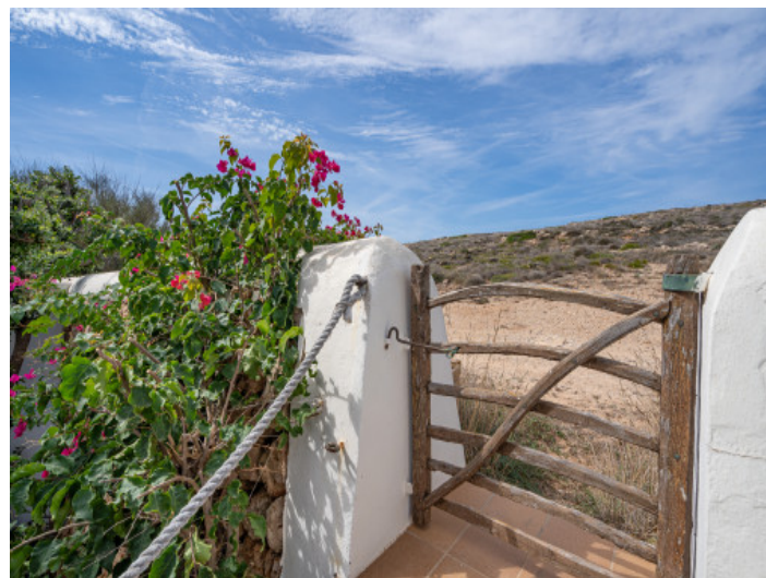
Access to the Cami de Cavalls