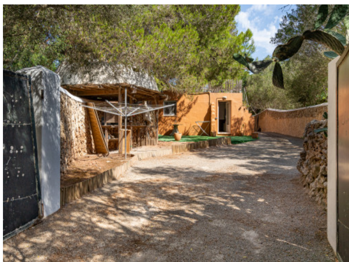
Access to the guest apartment