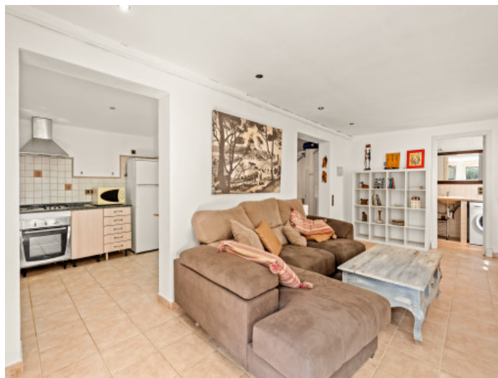
Separate guest apartment