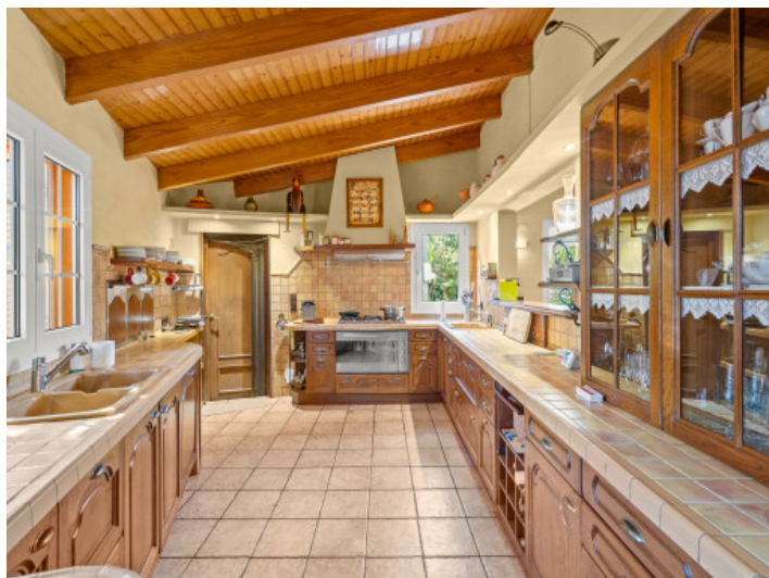
Large country house kitchen