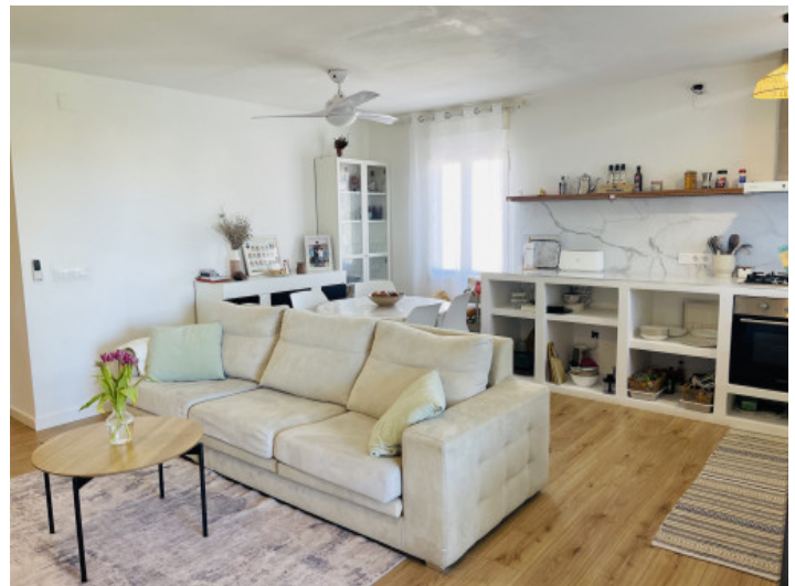
Upper living area