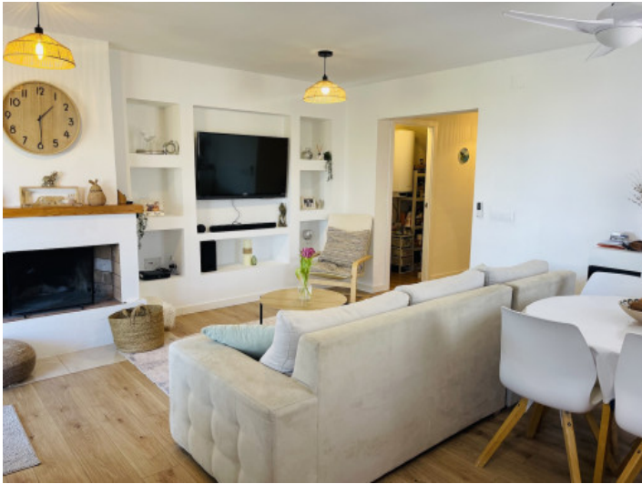
Upper living area