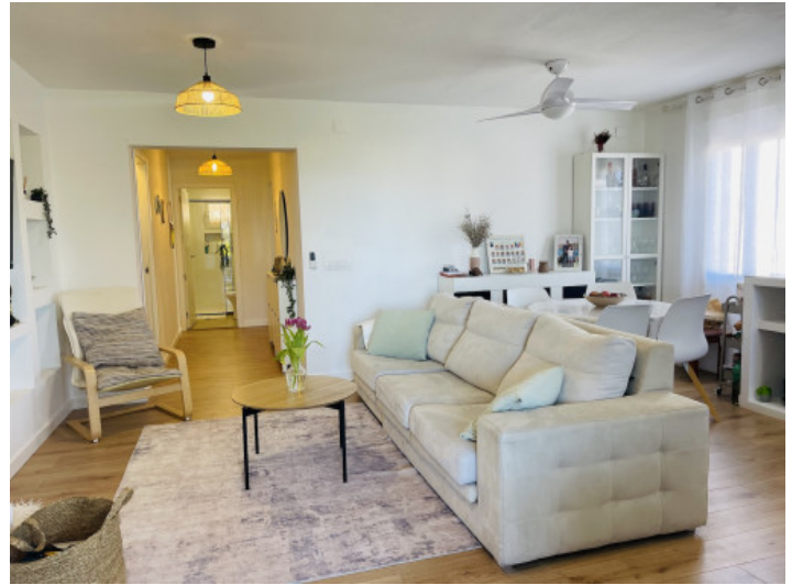
Upper living area