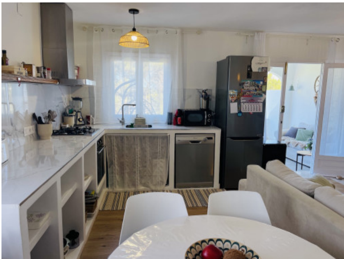
Upper living area