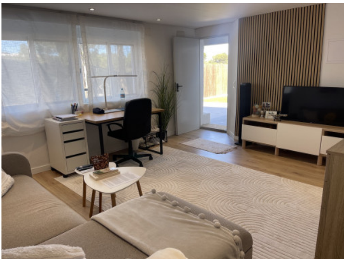
Lower living area