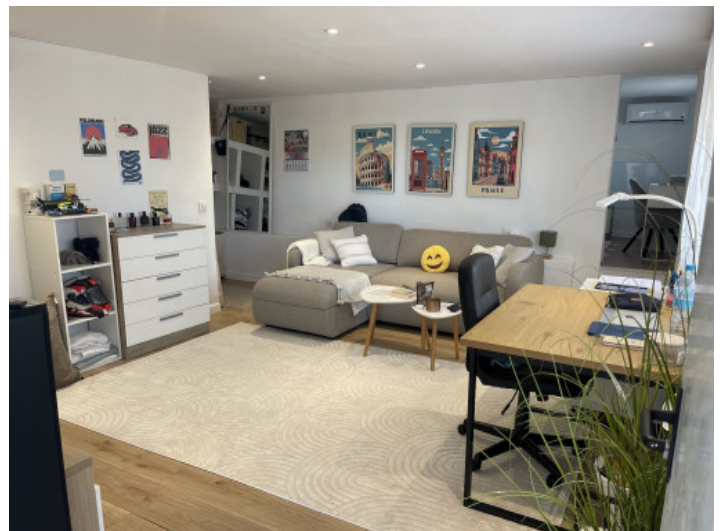
Lower living area

All information is correct to the best of our knowledge. Errors and prior sale excepted. This prospectus is purely for information purposes. Only the notarized deed of sale is legally binding.