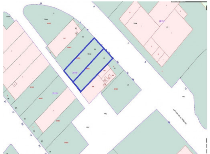
Plan of the plot