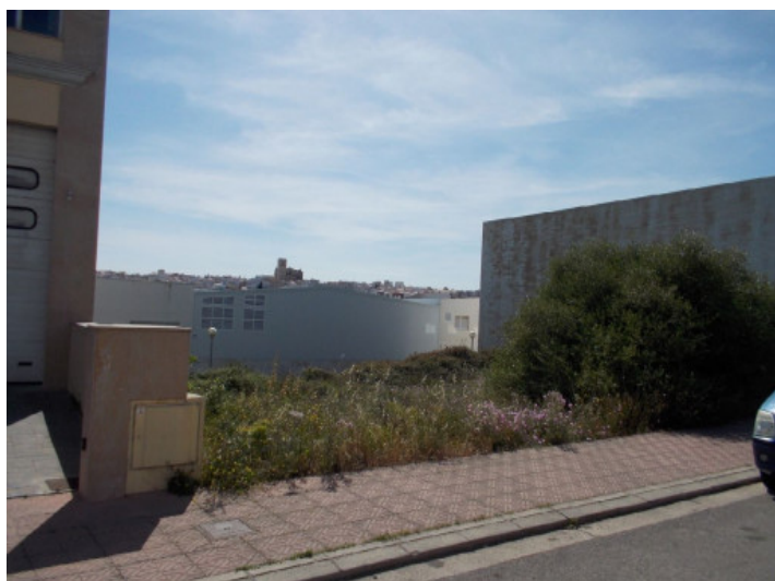
Back view of the plot