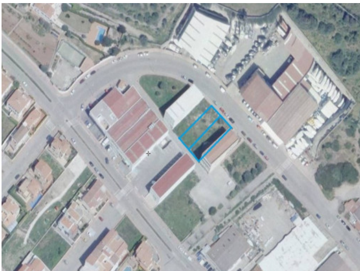
Location of the plot

All information is correct to the best of our knowledge. Errors and prior sale excepted. This prospectus is purely for information purposes. Only the notarized deed of sale is legally binding.