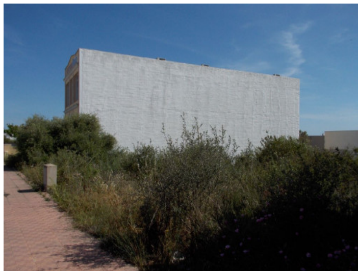
Alternative view of the plot