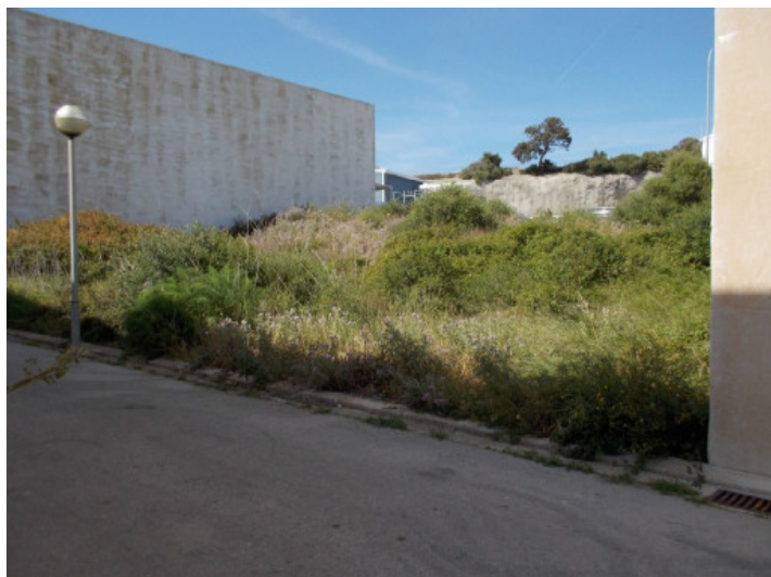
Alternative view of the plot