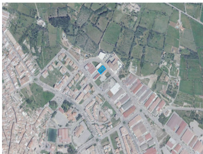
Location of the plot