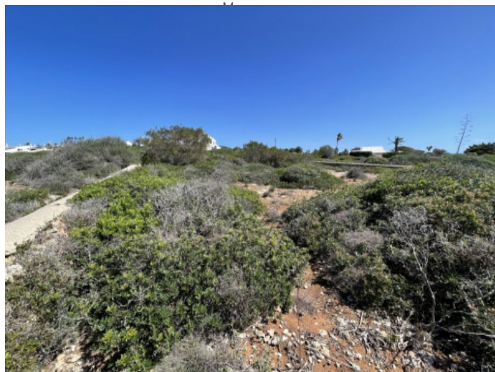
Magnificent investment plot, first line of sea, sea view, located in Binidali, Menorca