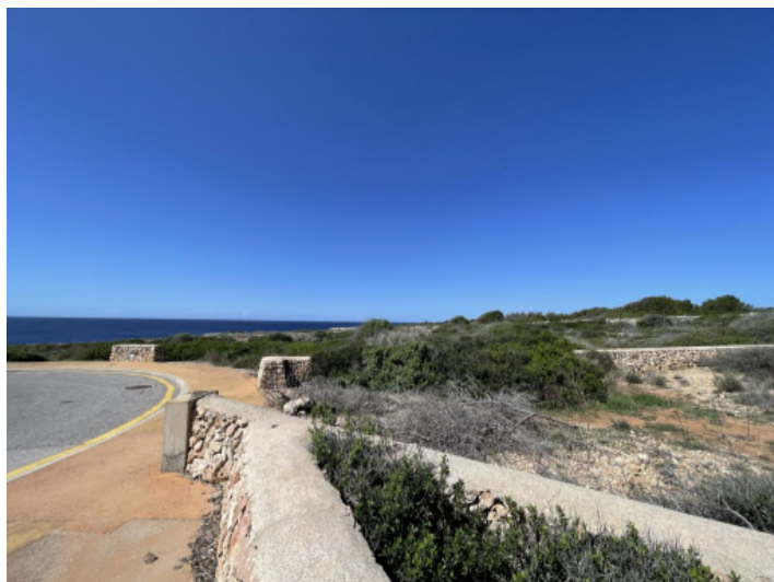
Magnificent investment plot, first line of sea, sea view, located in Binidali, Menorca.