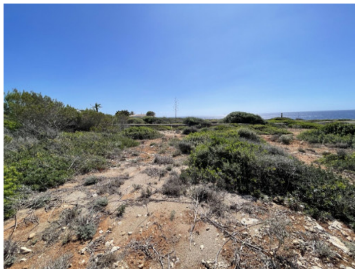
Magnificent investment plot, first line of sea, sea view, located in Binidali, Menorca.

All information is correct to the best of our knowledge. Errors and prior sale excepted. This prospectus is purely for information purposes. Only the notarized deed of sale is legally binding.