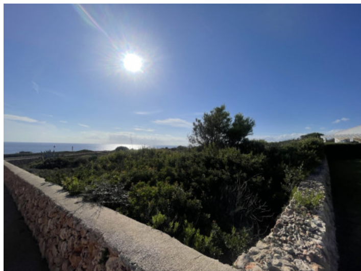
Magnificent investment plot, first line of sea, sea view, located in Binidali, Menorca