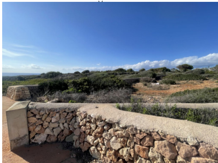
Magnificent investment plot, first line of sea, sea view, located in Binidali, Menorca

All information is correct to the best of our knowledge. Errors and prior sale excepted. This prospectus is purely for information purposes. Only the notarial deed of sale is legally binding.