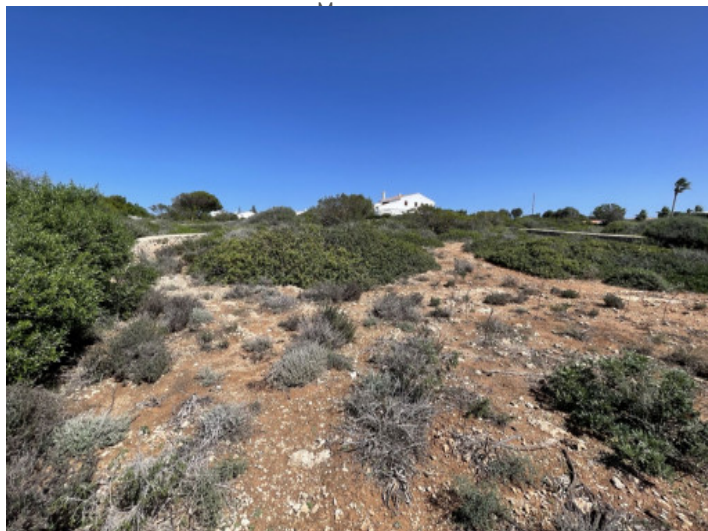
Magnificent investment plot, first line of sea, sea view, located in Binidali, Menorca