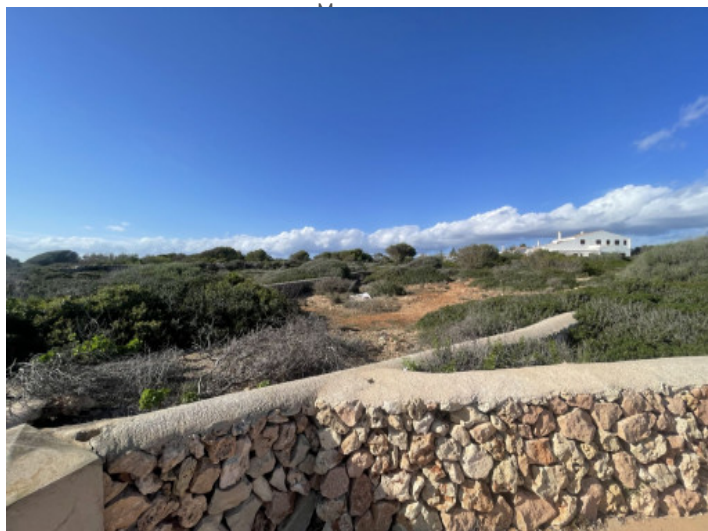
Magnificent investment plot, first line of sea, sea view, located in Binidali, Menorca