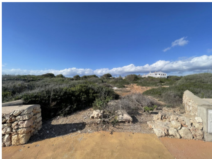
Magnificent investment plot, first line of sea, sea view, located in Binidali, Menorca