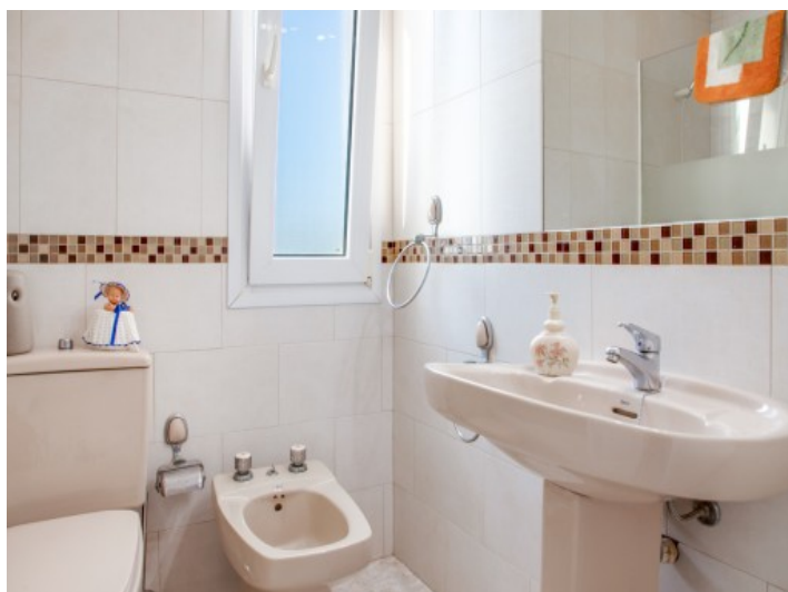
Bright bathroom with large mirror