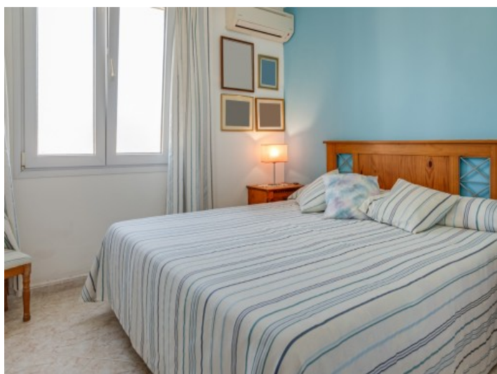
One of 4 beautiful bedrooms