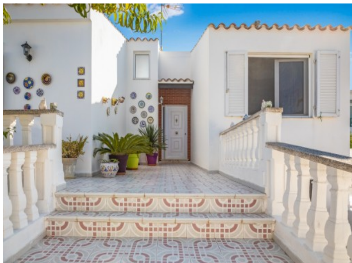
Lovely house with panorama views in Sol del Este