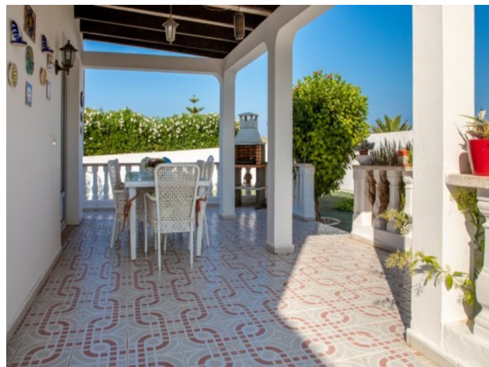
Covered terrace of the house