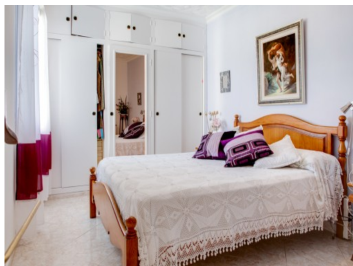
Second bedroom with bathroom en suite

All information is correct to the best of our knowledge. Errors and prior sale excepted. This prospectus is purely for information purposes. Only the notarized deed of sale is legally binding.