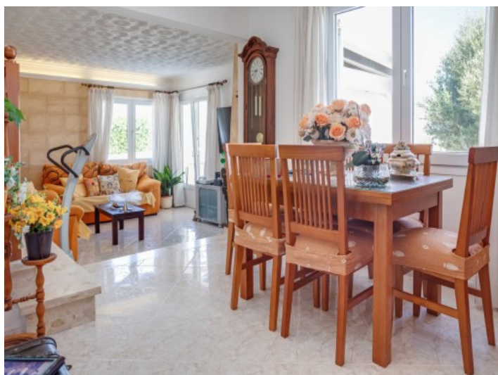
Light-flooded living and dining area