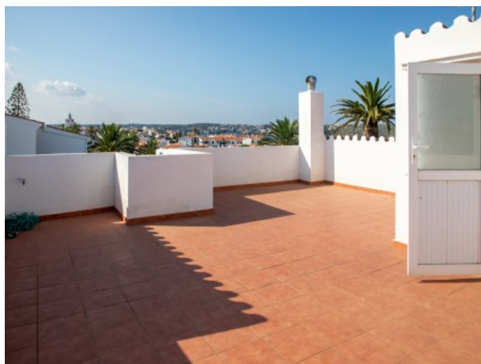
Sunny roof top terrace