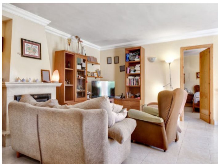
Cosy living area