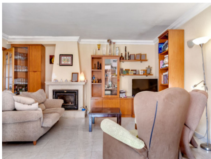
Alternative view of the living area with fireplace