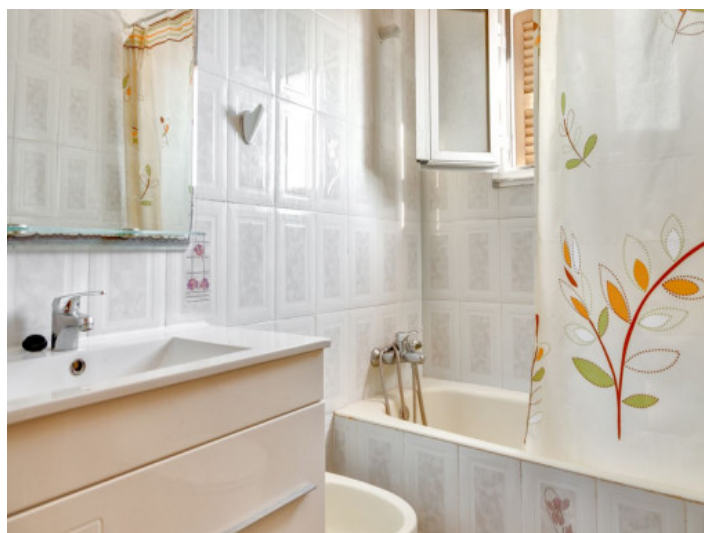
Bathroom with bathtub and daylight