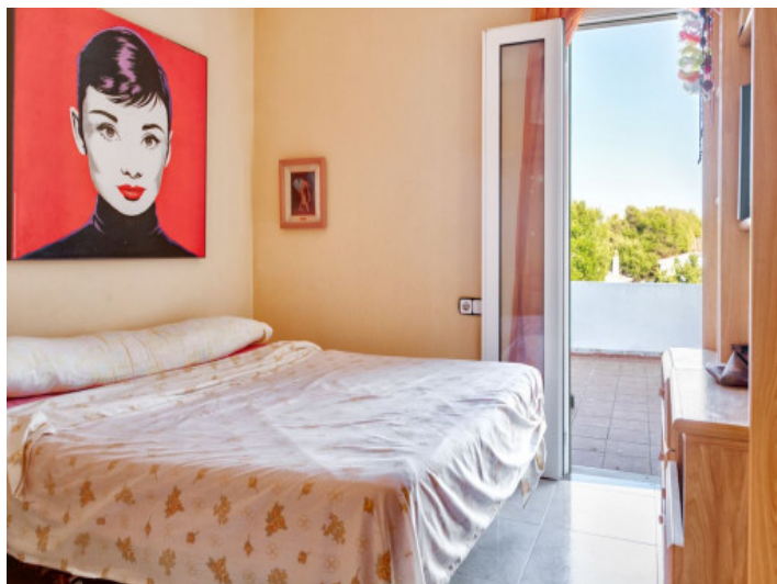
Bedroom with direct access to the terrace