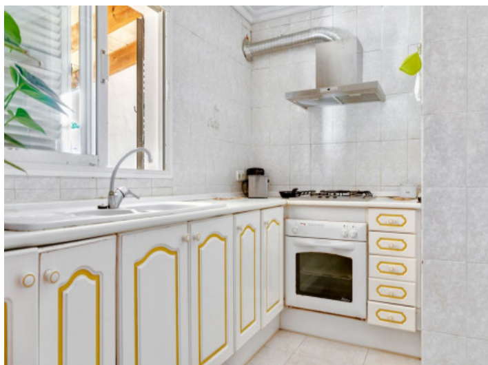
Bright and fully equipped kitchen