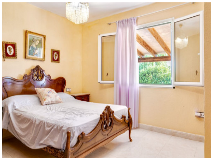
Homey bedroom with double bed

All information is correct to the best of our knowledge. Errors and prior sale excepted. This prospectus is purely for information purposes. Only the notarized deed of sale is legally binding.