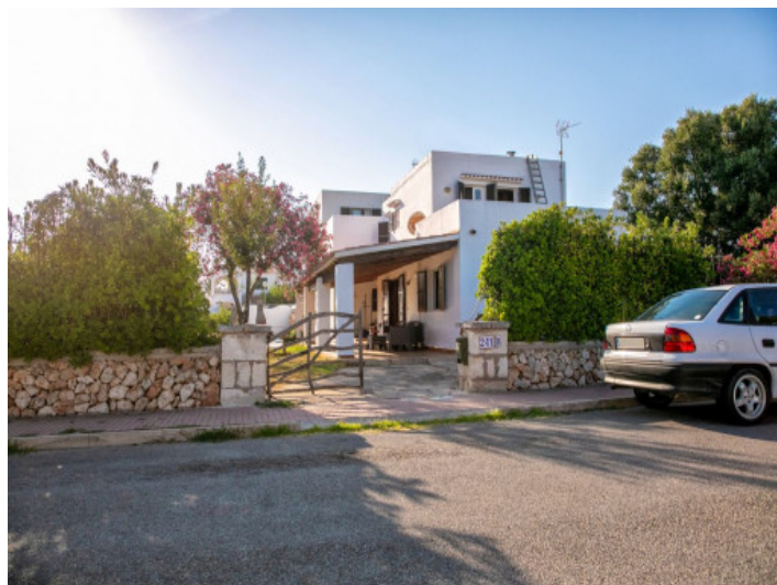
Driveway to the property