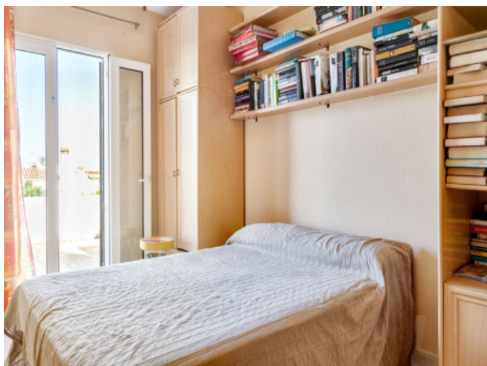
Another bedroom with access to the outdoor area