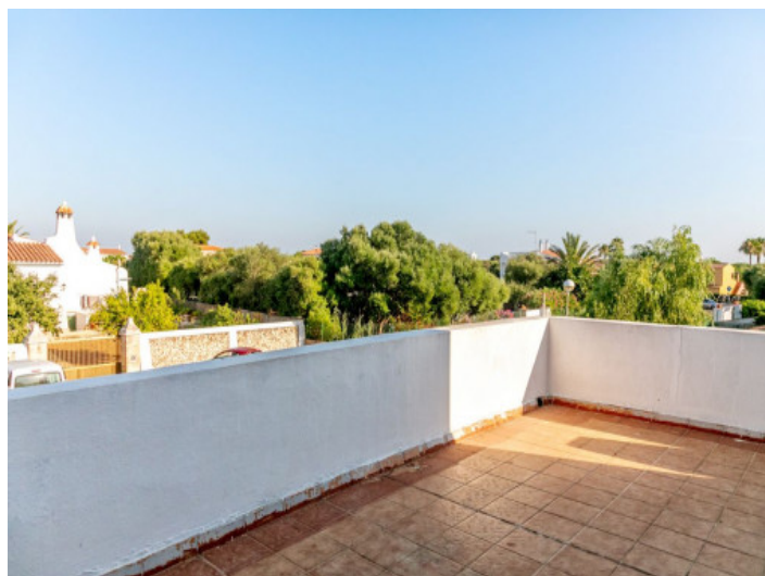
Spacious rooftop terrace with stunning views

All information is correct to the best of our knowledge. Errors and prior sale excepted. This prospectus is purely for information purposes. Only the notarized deed of sale is legally binding.