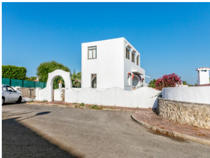
Exterior view of the house