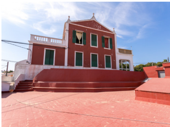
Rear view of the large villa