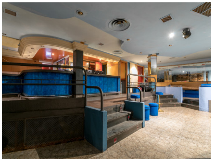
View of the bar area

All information is correct to the best of our knowledge. Errors and prior sale excepted. This prospectus is purely for information purposes. Only the notarized deed of sale is legally binding.