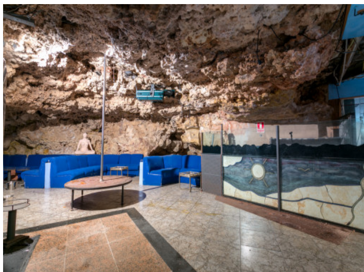
Disco in the cliffs