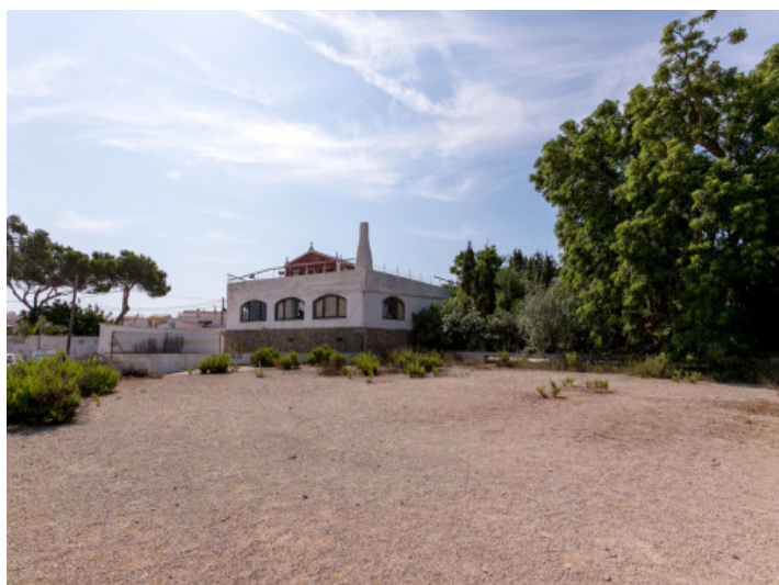
Access to the villa

All information is correct to the best of our knowledge. Errors and prior sale excepted. This prospectus is purely for information purposes. Only the notarized deed of sale is legally binding.