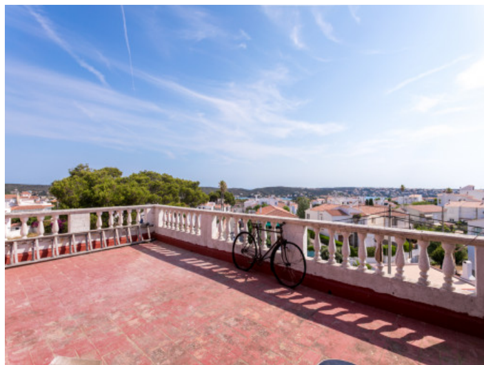
Roof terrace with fantastic views of the harbour