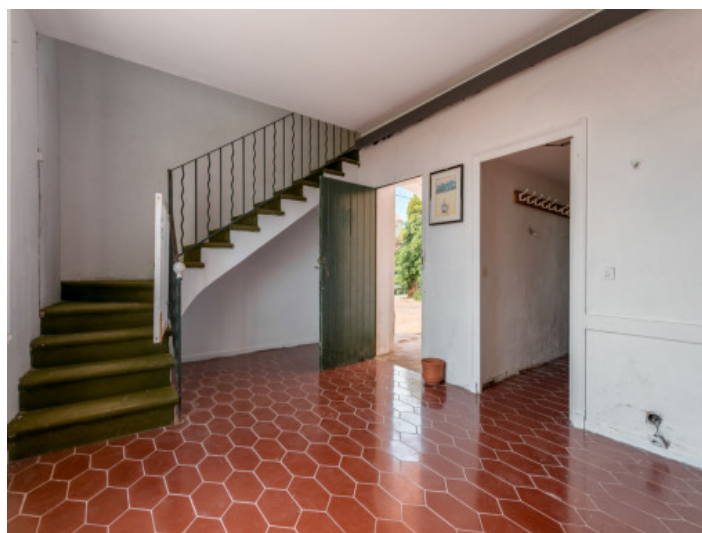
Entrance area with staircase