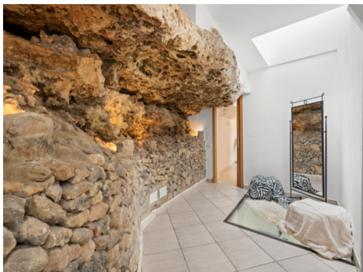
Corridor with original rock