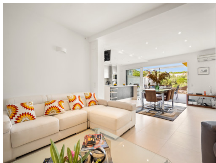
Lightflooded and adjoining living area

All information is correct to the best of our knowledge. Errors and prior sale excepted. This prospectus is purely for information purposes. Only the notarized deed of sale is legally binding.