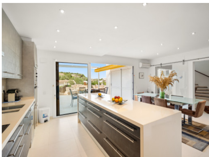
High-quality, open kitchen