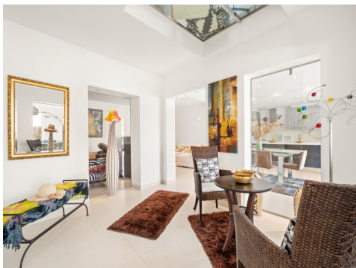
Further beautifully designed living room