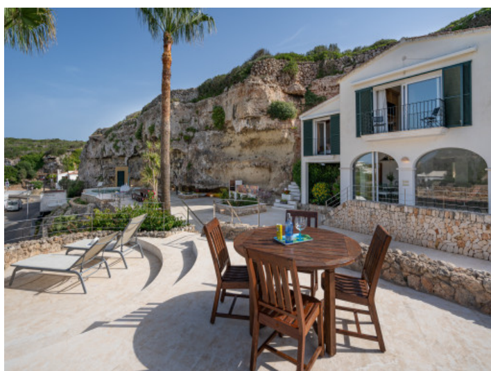
Extensive terrace with various areas