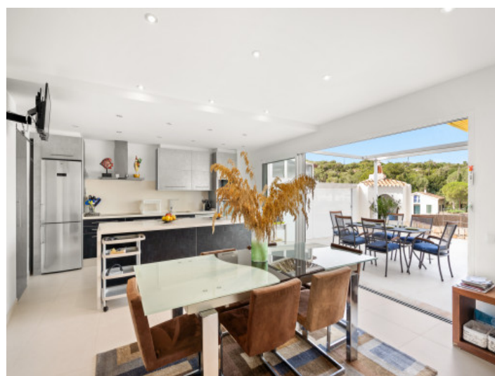
Bright dining area with access to the terrace