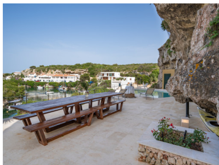
Large outdoor terrace with sea views