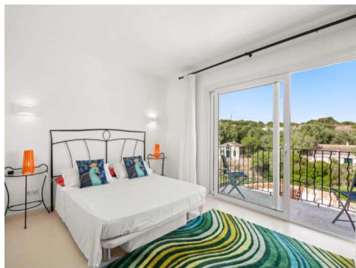
Double bedroom with balcony