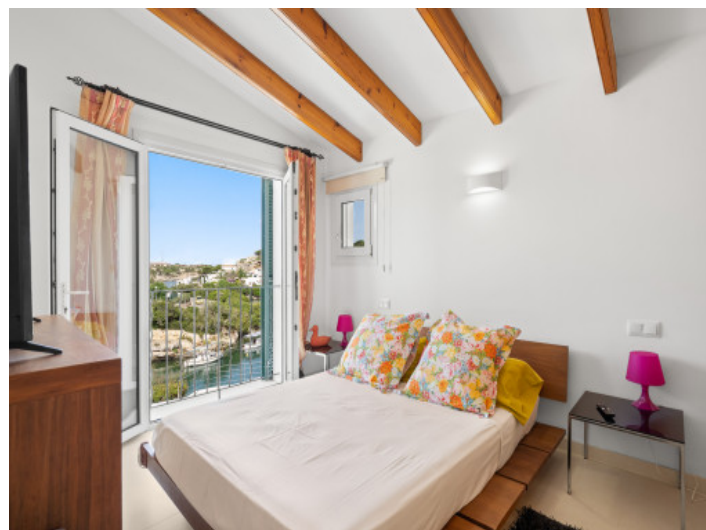
Further sea view bedroom

All information is correct to the best of our knowledge. Errors and prior sale excepted. This prospectus is purely for information purposes. Only the notarized deed of sale is legally binding.