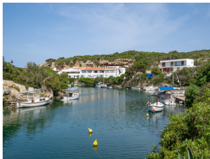
Beautiful views over the bay