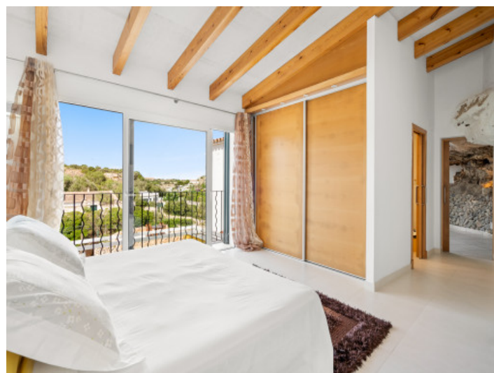
One of 3 bright bedrooms