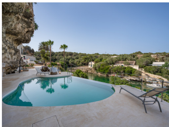
Pool in first sea line