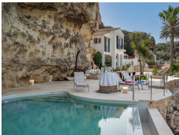
Impressive pool area with huge rock