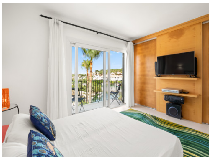
Wonderful sea view bedroom