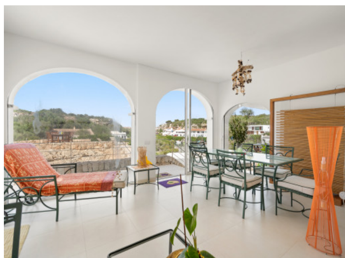
Further living area with panorama windows