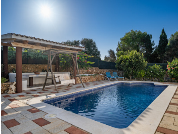
Beautiful pool area with seating area