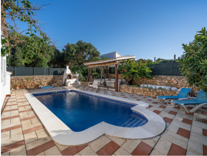
Pool with bbq area