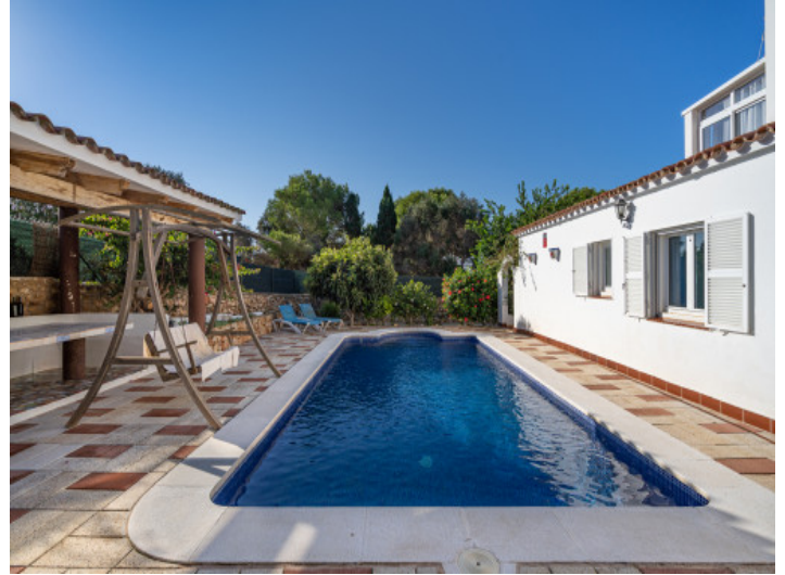
Tranquil pool area