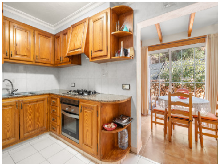
Wooden kitchen with separate dining area