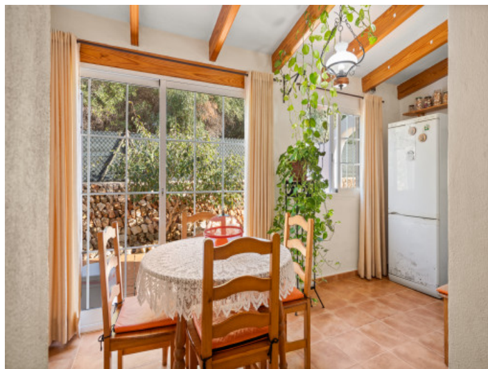
Bright dining area with terrace access