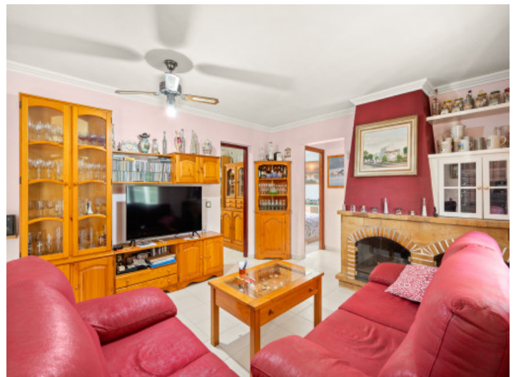
Comfortable living area with fireplace

All information is correct to the best of our knowledge. Errors and prior sale excepted. This prospectus is purely for information purposes. Only the notarized deed of sale is legally binding.