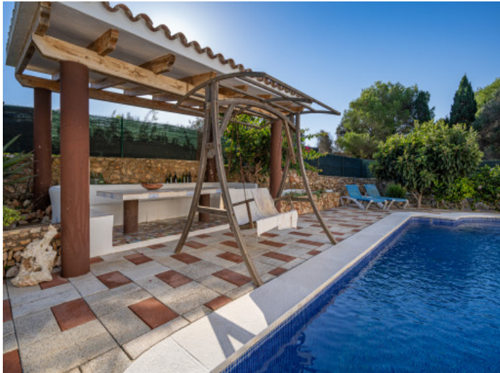
Tranquil lounge area