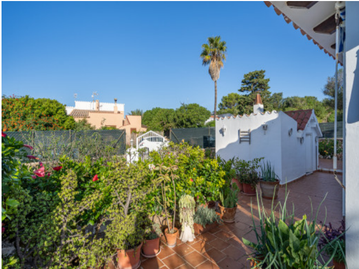
Inviting access to the house