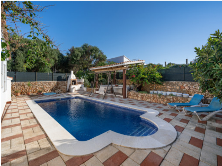
Pool with bbq area