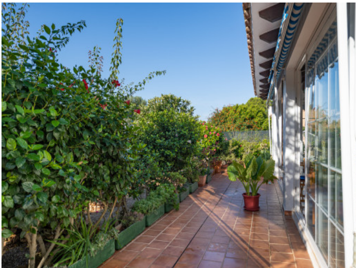
Beautifully planted terrace