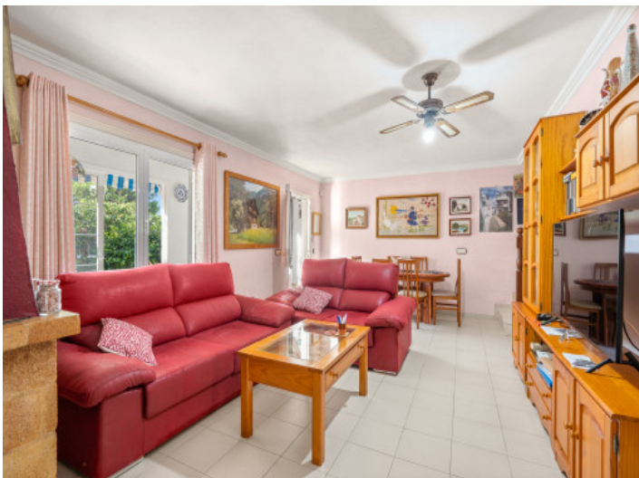
Living and dining area with terrace access