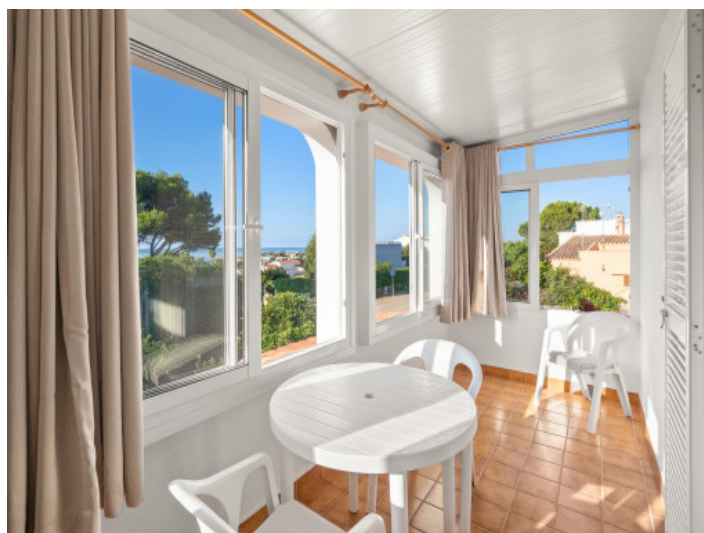
Adjoining closed terrace with sea views