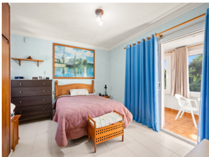
Bedroom on the upper floor