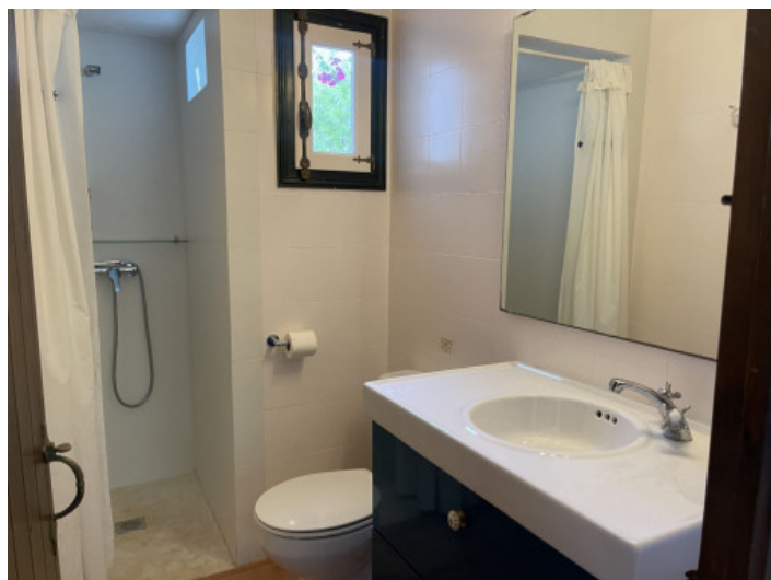
Chalet with 2 bathrooms

All information is correct to the best of our knowledge. Errors and prior sale excepted. This prospectus is purely for information purposes. Only the notarized deed of sale is legally binding.