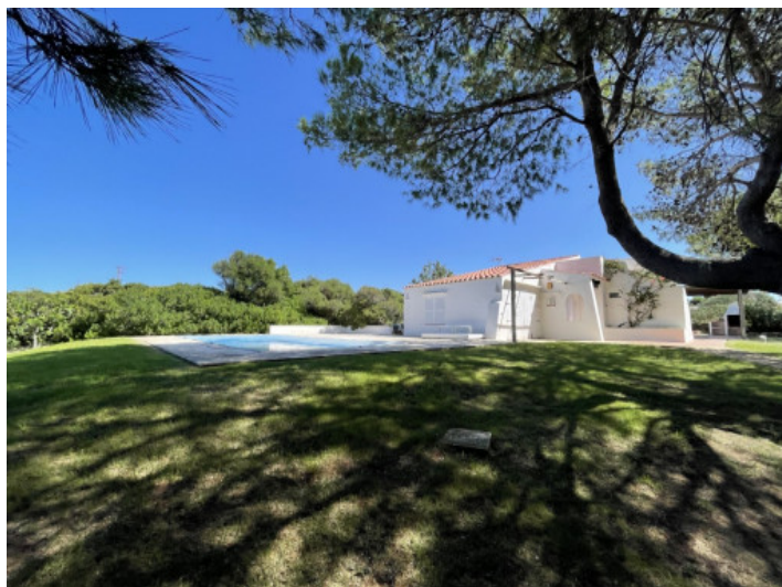
view to the house