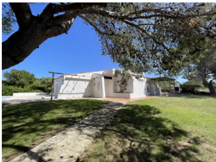
Very nice house